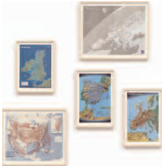
IMAGES FOUR (ABOVE) THROUGH NINE: Mona Hatoum (British of Palestinian origin, born in Beirut, Lebanon, 1952). Routes II . 2002. Colored ink and gouache on printed maps; five, six, and eight: gouache on printed map; seven and nine: colored ink on printed map, five: 9¼ x 8" (24.8 x 20.3 cm), six: 11 x 16" (27.9 x 40.6 cm), seven: 10¾ x 15" (27.3 x 38.1 cm), eight: 10 ¼ x 8" (27.3 x 20.3 cm), nine: 11 x 8½" (27.9 x 21.6 cm). The Judith Rothschild Foundation Contemporary Drawings Collection Gift. © 2009 Mona Hatoum