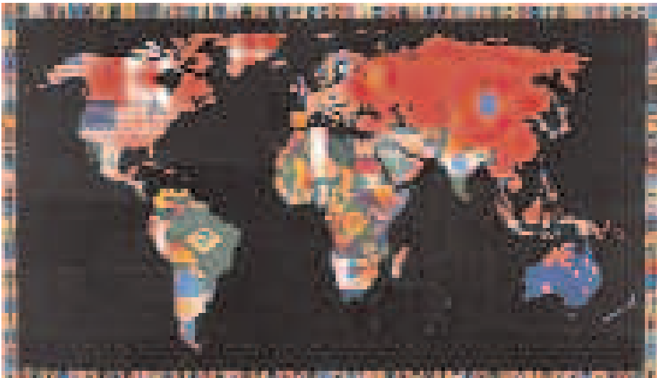
IMAGE THREE: Alighiero e Boetti (Italian, 1940–1994). Map of the World . 1989. Embroidery on fabric, 46 1/4" x 7' 3 3/4" x 2" (117.5 x 227.7 x 5.1 cm). Scott Burton Fund. © 2009 Estate of Alighiero e Boetti