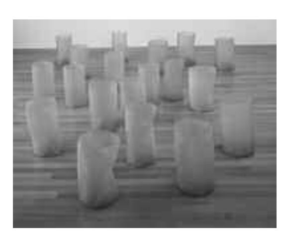
IMAGE FIVE: Eva Hesse. American, born Germany. 1936–1970. Repetition Nineteen III . 1968. Fiberglass and polyester resin, nineteen units, each 19 to 20 ¼" (48 to 51 cm) x 11 to 12 ¾" (27.8 to 32.2 cm) in diameter. Gift of Charles and Anita Blatt. © 2007 Estate of Eva Hesse. Galerie Hauser & Wirth, Zurich

IMAGE THREE: Yayoi Kusama. Japanese, born 1929. Accumulation of Stamps, 63. 1962. Pasted labels and ink on paper, 23 ¾ x 29" (60.3 x 73.6 cm). Gift of Philip Johnson. © 2007 Yayoi Kusama