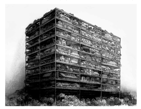
IMAGE 32 : Exterior perspective. 1981. Ink and charcoal on paper, 22 x 24" (55.9 x 61 cm). The Museum of Modern Art, New York. Best Products Company Inc. Architecture Fund, 1981

James Wines (SITE) (American, born 1932)