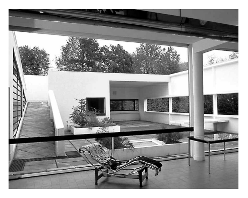
IMAGE 12: Living room and roof garden. 1995–99. Photo: Paul Koslowski. Fondation Le Corbusier. © 2004 Artist Rights Society (ARS), New York/ ADAGP, Paris