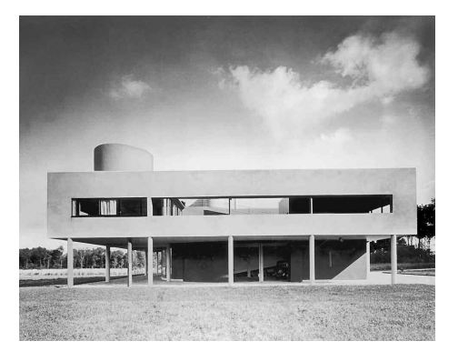
IMAGE 10: Exterior view. 1930.