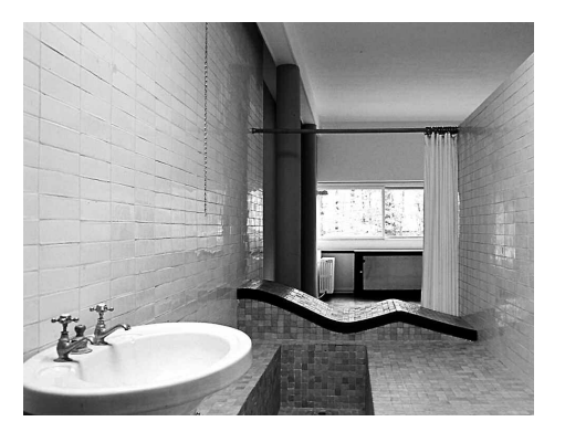
IMAGE 13: Master apartment bathroom. 1995–99. Photo: Paul Koslowski. Fondation Le Corbusier. © 2004 Artists Rights Society (ARS), New York/ADAGP, Paris