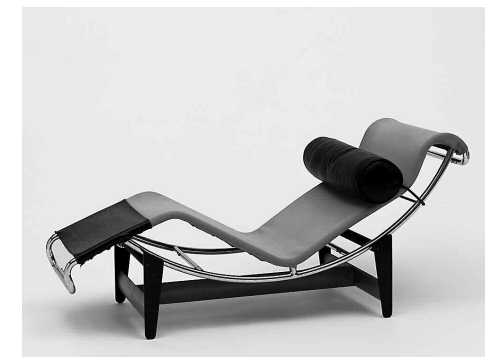
IMAGE 15: Le Corbusier, with Pierre Jeanneret and Charlotte Perriand (French, 1903–1999). Chaise Longue. 1928. Chrome-plated steel, fabric, and leather, 26\frac{3}{8} \times 23 \times 62\frac{3}{8} " (67 x 58.4 x 158.4 cm). The Museum of Modern Art, New York. Gift of Thonet Industries, Inc.