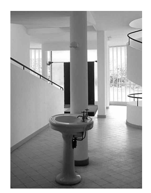
IMAGE 11: Entrance hall. 1995–99.