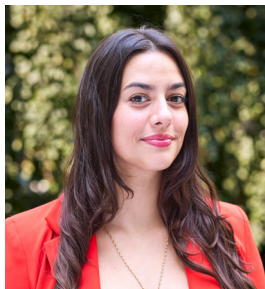
Carolina (she/her) 10/27/69 Sam Gilliam