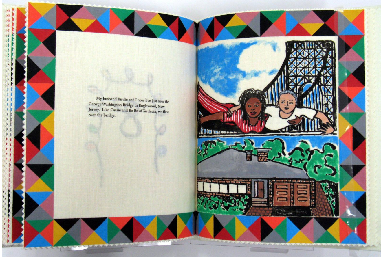
Plate (folio 16) from Seven Passages to a Flight

My husband Birdie and I now live just over the George Washington Bridge in Englewood, New Jersey. Like Cassie and Be Be of Tar Beach , we flew over the bridge.