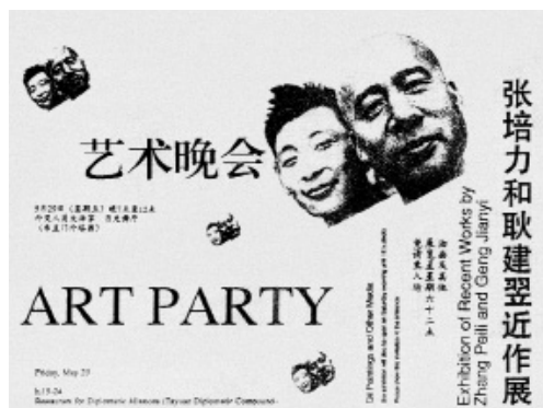
Poster produced on the occasion of Exhibition of Recent Works by Zhang Peili and Geng Jianyi , May 29, 1991, Diplomatic Missions Restaurant, Beijing

Yin Xiuzhen. Ruined Capital . 1996. Installation of furniture and cement at the Art Museum of Capital Normal University, Beijing