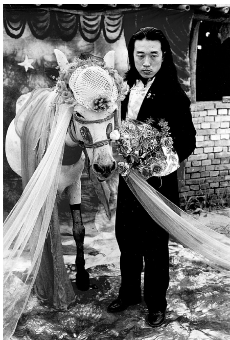
Wang Jin. To Marry a Mule . July 28, 1995. Photograph of performance, 109 × 71½" (277 × 182 cm)

resembling a common newspaper. Each of its four pages was used by one of the four artists to express himself directly to his audience. In this way, these artists' final products became inseparable from the notion of the newspaper, and the idea of artistic creativity became subordinate to the broader concept of mass communication. . . . We put Talents in public spaces such as bookstores and fairs. People could take it free of charge. 18