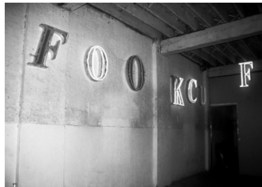
Interior view of the Fuck Off exhibition, November 4–20, 2000, Eastlink Gallery, Shanghai

It would be a mistake, however, to take Zhu and Gu as representatives of all independent curators and experimental artists, because their views were by no means shared by everyone in the multifaceted community of experimental art. As mentioned