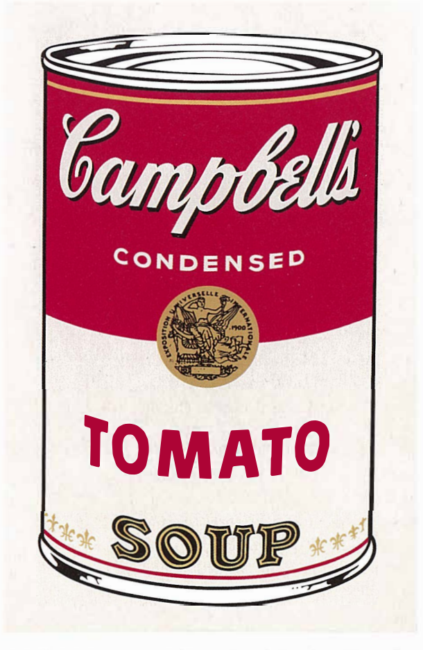
Andy Warhol. American (1928–1987). Tomato Soup from the portfolio Campbell's Soup I . 1968. 31 % x 18 %" (81.0 x 47.6 cm). Gift of Philip Johnson

For screenprints, mesh (originally silk) is stretched tautly across a frame. An image is glued or otherwise affixed onto the mesh to mask out compositional areas. This image can be created from a variety of materials: cut paper, a hardening form of glue, or a special gelatin (for photographic imagery). Unlike procedures for the techniques of woodcut, etching, and lithography, no printing press is required to transfer this image from screen to paper. Rather, paper is placed directly beneath the screen, and a tool with a flat rubber edge, called a squeegee, is used to push ink through the mesh. Areas masked out by compositional shapes are nonporous and obstruct the ink, reading as white shapes after printing. When more than one color is needed, as here, separate screens are used for each color.