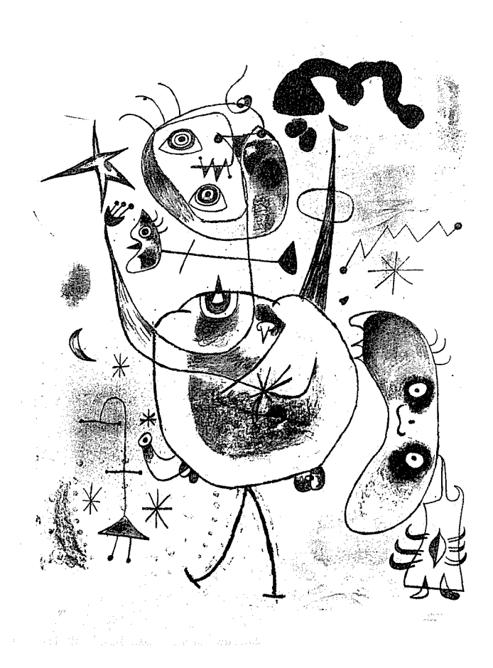
Joan Miró. Spanish (1893–1983). Plate XXIII from the Barcelona Series . 1944. 24% x 18%<sup>4</sup>" (61.9 x 47.3 cm). Purchase Fund

then dampened with water, which adheres only to the non-greasy areas. With a roller, oily printer's ink is applied and sticks only to the greasy drawn sec-