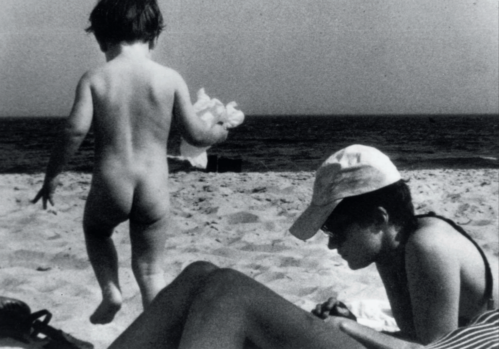
11. Su Friedrich (American, born 1954). Sink or Swim . 1990. 16mm film (black and white, sound), 48 min. The Museum of Modern Art, New York. Purchase