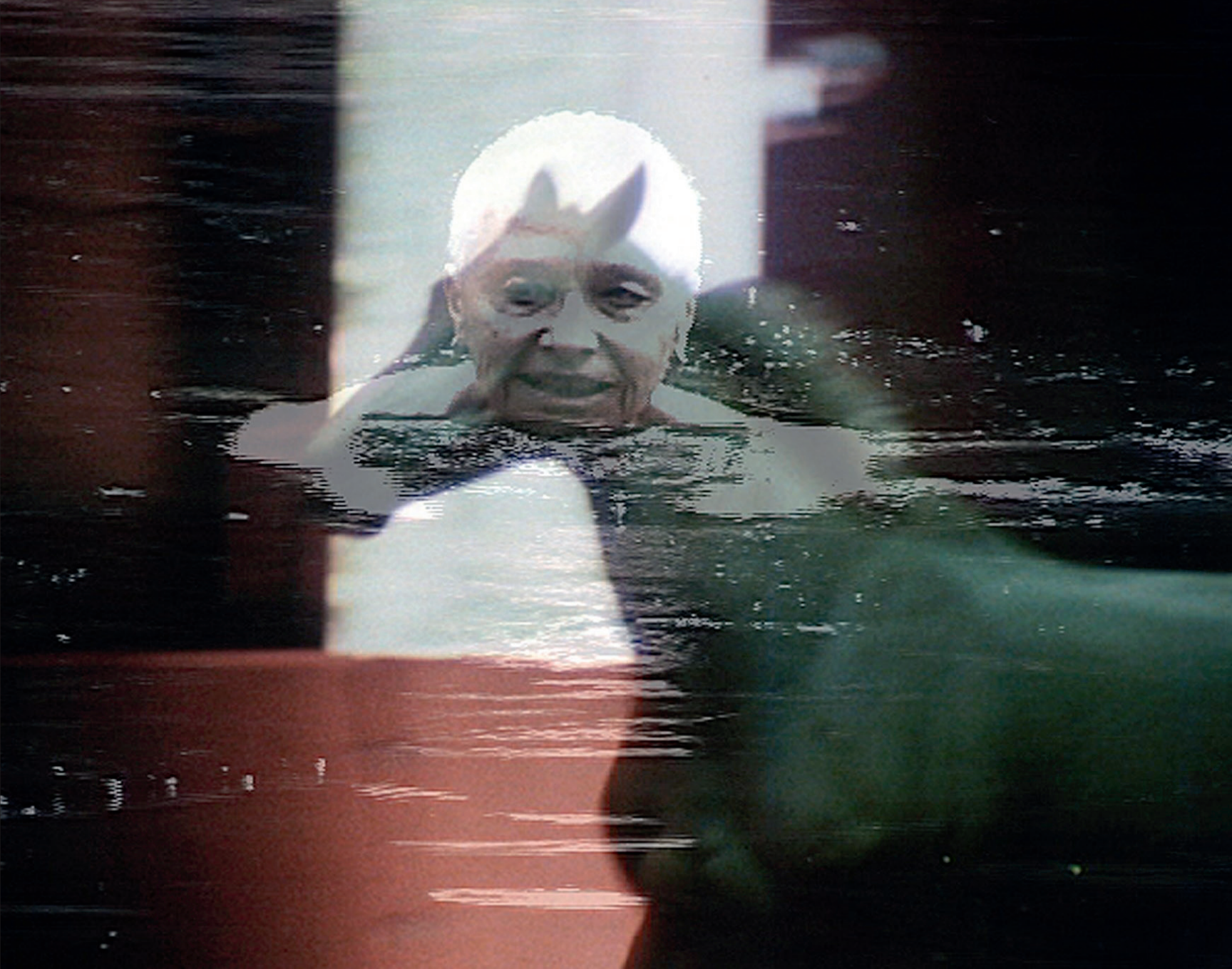
9. Barbara Hammer (American, born 1939). A Horse Is Not a Metaphor . 2008. Digital video (color and black and white, sound by Meredith Monk), 30 min. The Museum of Modern Art, New York. Purchase