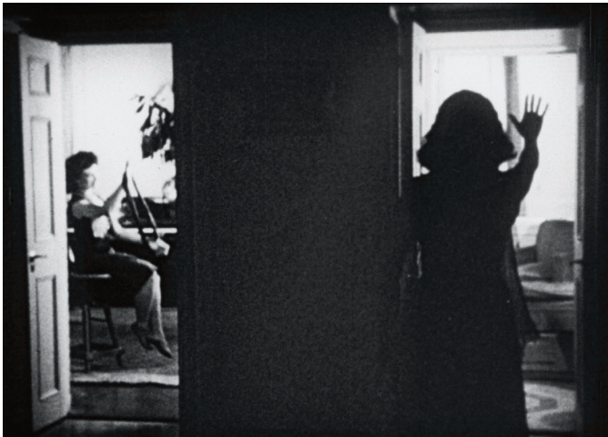
4. Maya Deren (American, born Ukraine. 1917–1961). Ritual in Transfigured Time . 1946. 16mm film (black and white, silent), 15 min. The Museum of Modern Art, New York. Gift of Alexander Hammid