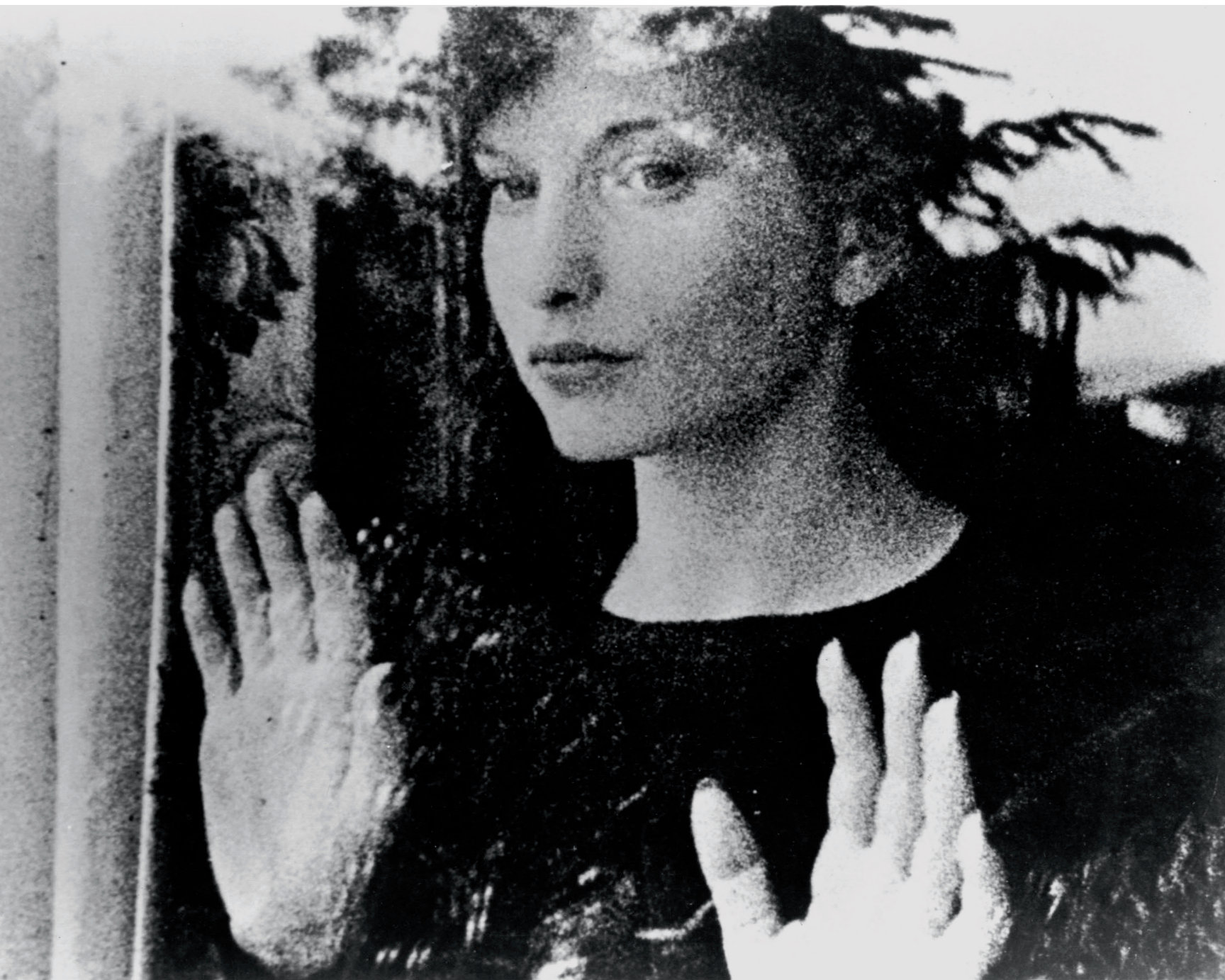
1. Maya Deren (American, born Ukraine. 1917–1961). Alexander Hammid (American, born Austria. 1907–2004). Meshes of the Afternoon . 1943. 16mm film (black and white, silent; music by Teiji Ito added 1959), 14 min. The Museum of Modern Art, New York. Purchase from the artist