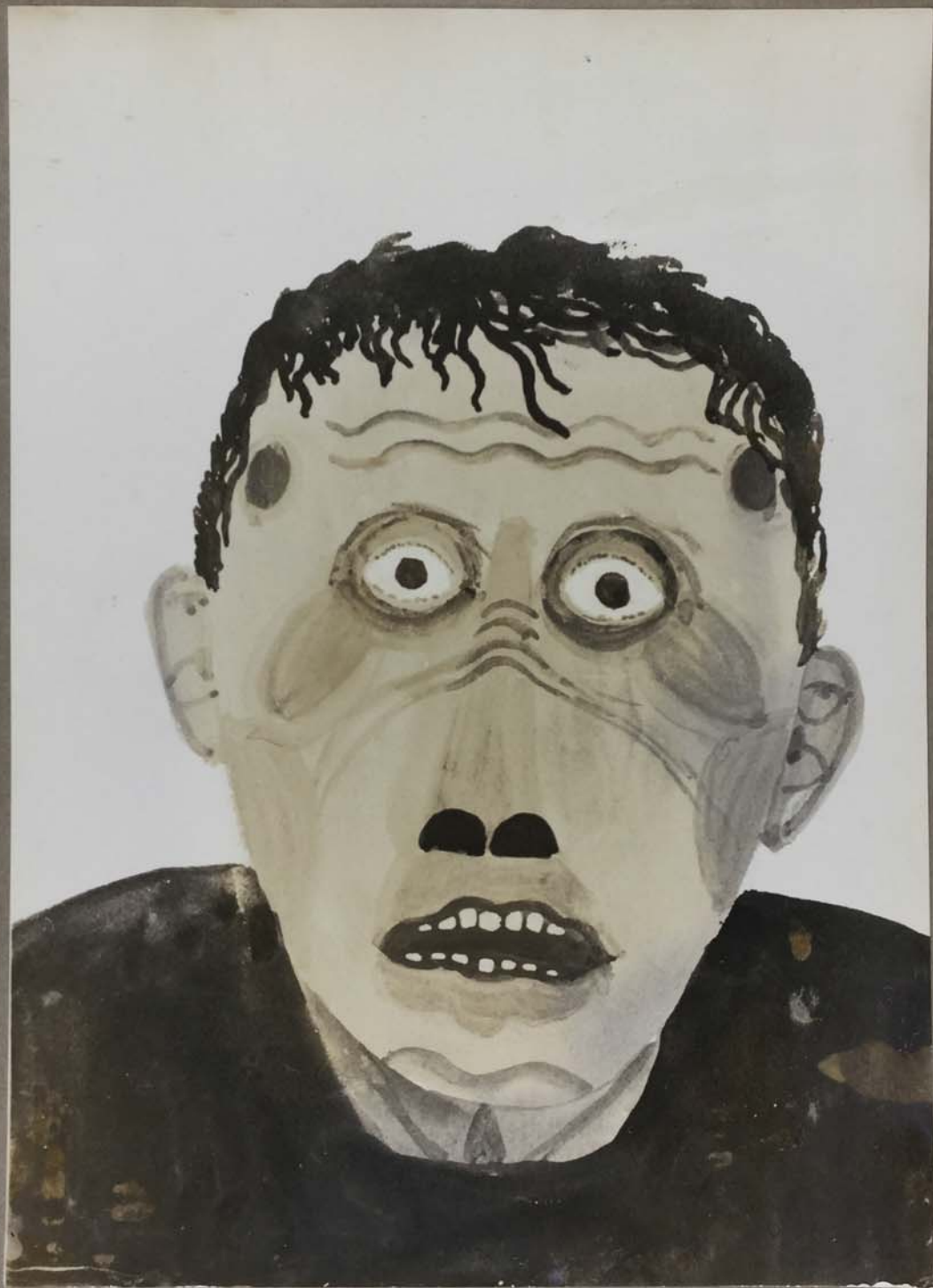
VISUAL AND NON-VISUAL EXPRESSION IN ART. Young People's Gallery. Head of a man, wc.