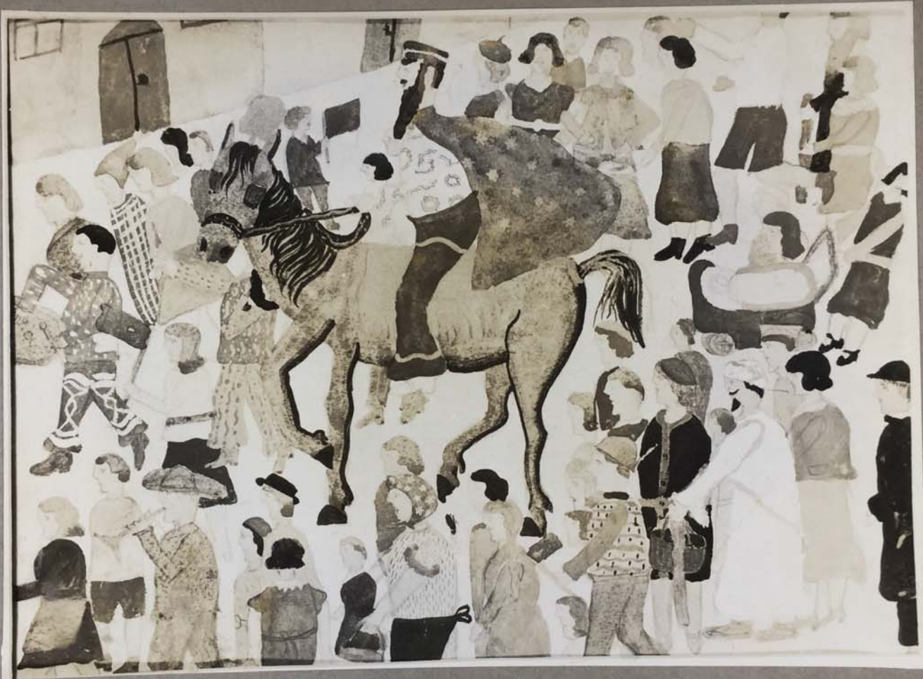
VISUAL AND NON-VISUAL EXPRESSION IN ART. Young People's Gallery. Jews Leave Egypt, wc.