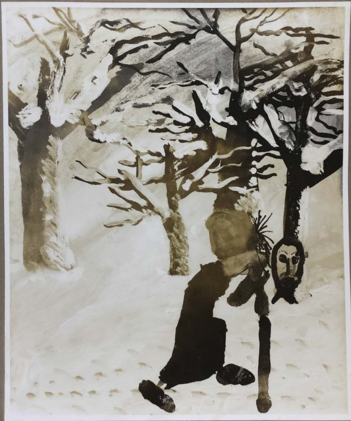
VISUAL AND NON-VISUAL EXPRESSION IN ART. Young People's Gallery. Woman Gathering Wood . wc, visual.