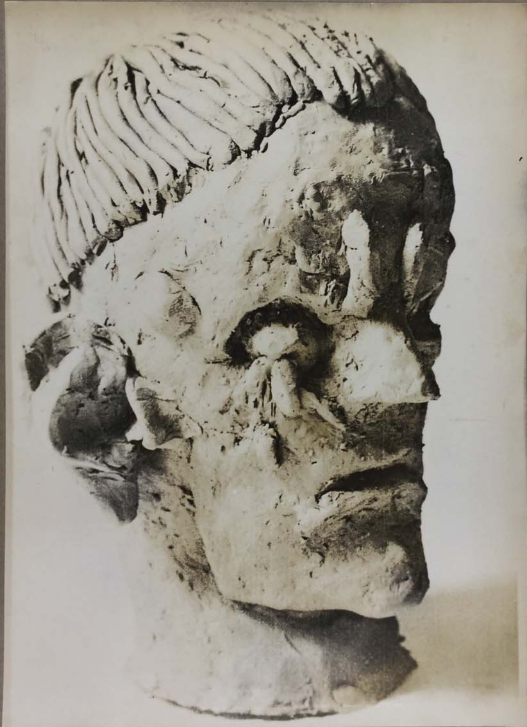
VISUAL AND NON-VISUAL EXPRESSION IN ART. Young People's Gallery. Haptic head, clay.