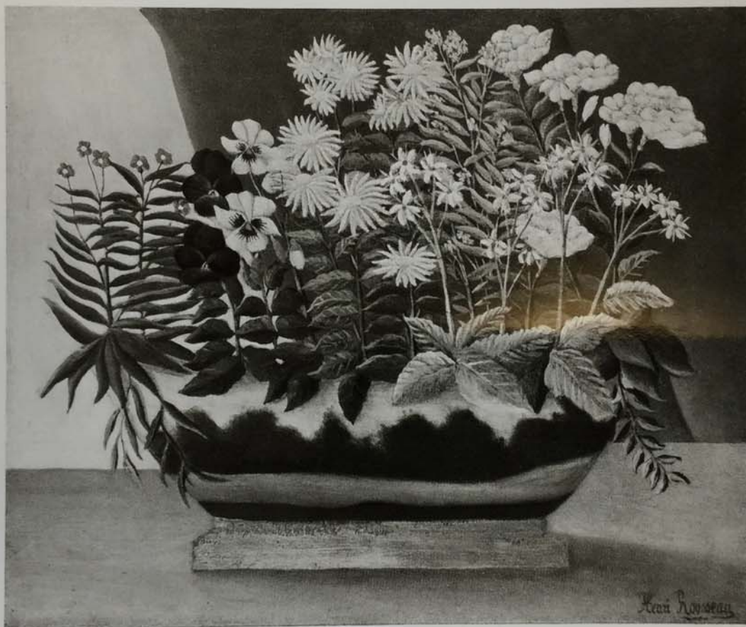
Poet's Bouquet (Fleurs de poète), 1890-95, Oil, 15 x 18 inches, Collection William S. Paley.