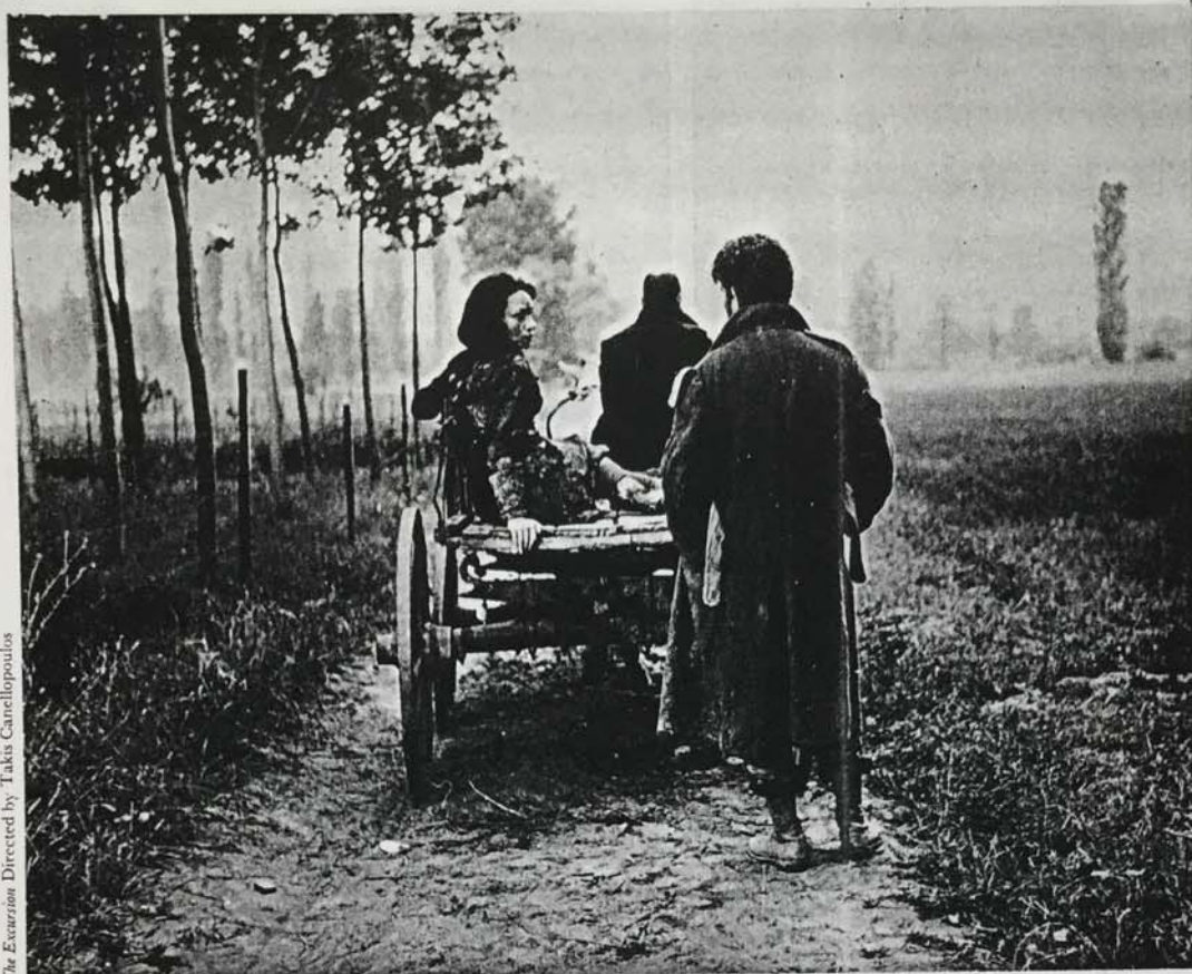
The Excursion Directed by Takis Canellopoulos

peasant dramas with subjects drawn from the 1821 Revolution to the beginning of this century).