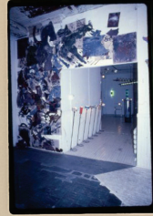
Feb 15 - Apr 5, 1981 P.S.1