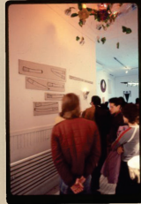
Feb 15 - Apr 5, 1981