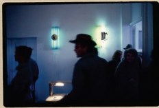
Feb 15 - Apr 5, 1981