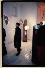
Feb 15 - Apr 5, 1981