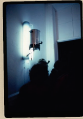
Feb 15 - Apr 5, 1981 P.S.1