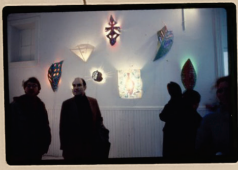
Feb 15 - Apr 5, 1981