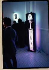
Feb 15 - Apr 5, 1981