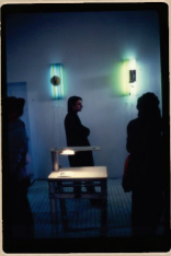
Feb 15 - Apr 5, 1981