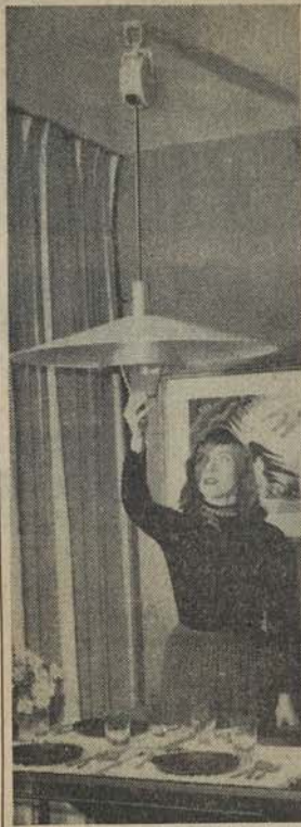
NEW YORK, May 25 — This new hanging lamp, which works on a reel, can be adjusted like a curtain by a handle at the bottom. It is designed to hang from a point just under the reel to a few feet above the floor where it can be used for children's play or reading. It is part of the modern lighting installed in a house on exhibit at the Museum of Modern Art.