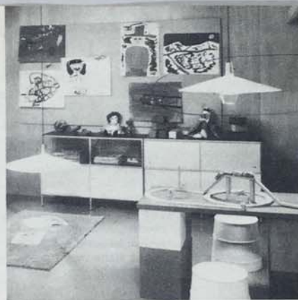
STEP INTO THE LIVING-ROOM—NEXT PAGE