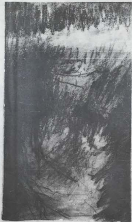
valley in the mountains with trees