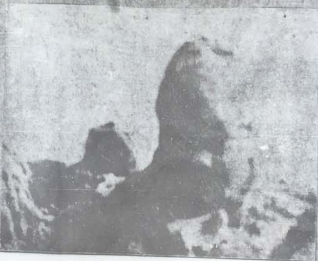
IMPRESSION D'OMNIBUS : UNE CONCIERGE, par Rosso, Milan, 1883-84.