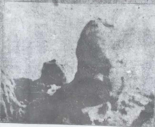
IMPRESSION D'OMNIBUS : UNE CONCIERGE, par Rosso, Milan, 1883-84.