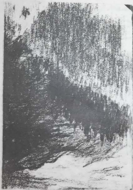
drawing of trees & shrubs with snow foto of a drawing