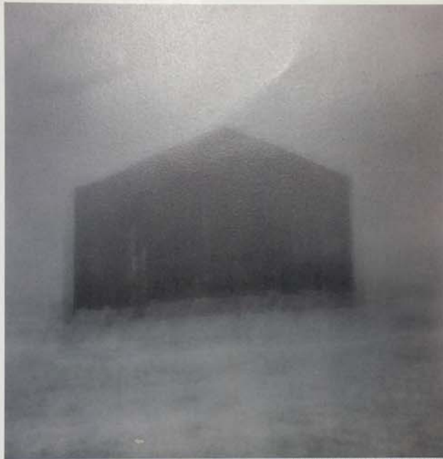
Untitled, "OUTSIDE 1991," type C print, 19" x 19 1/2"