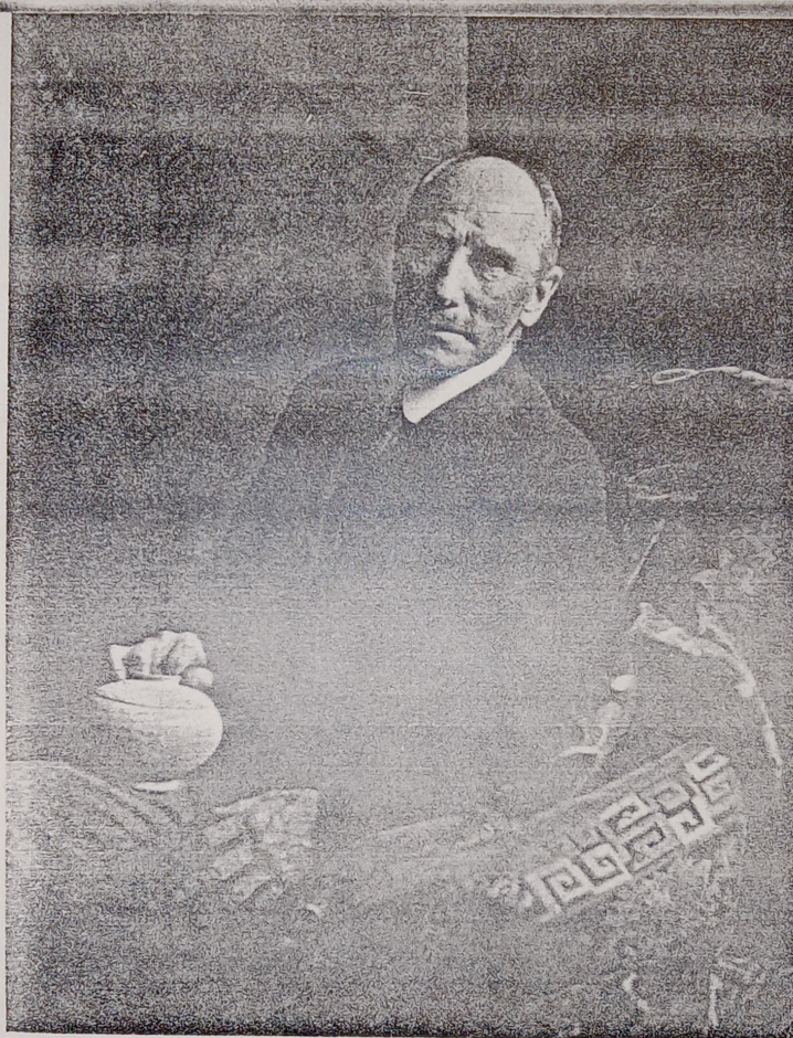
Charles Lang Freer, 1916