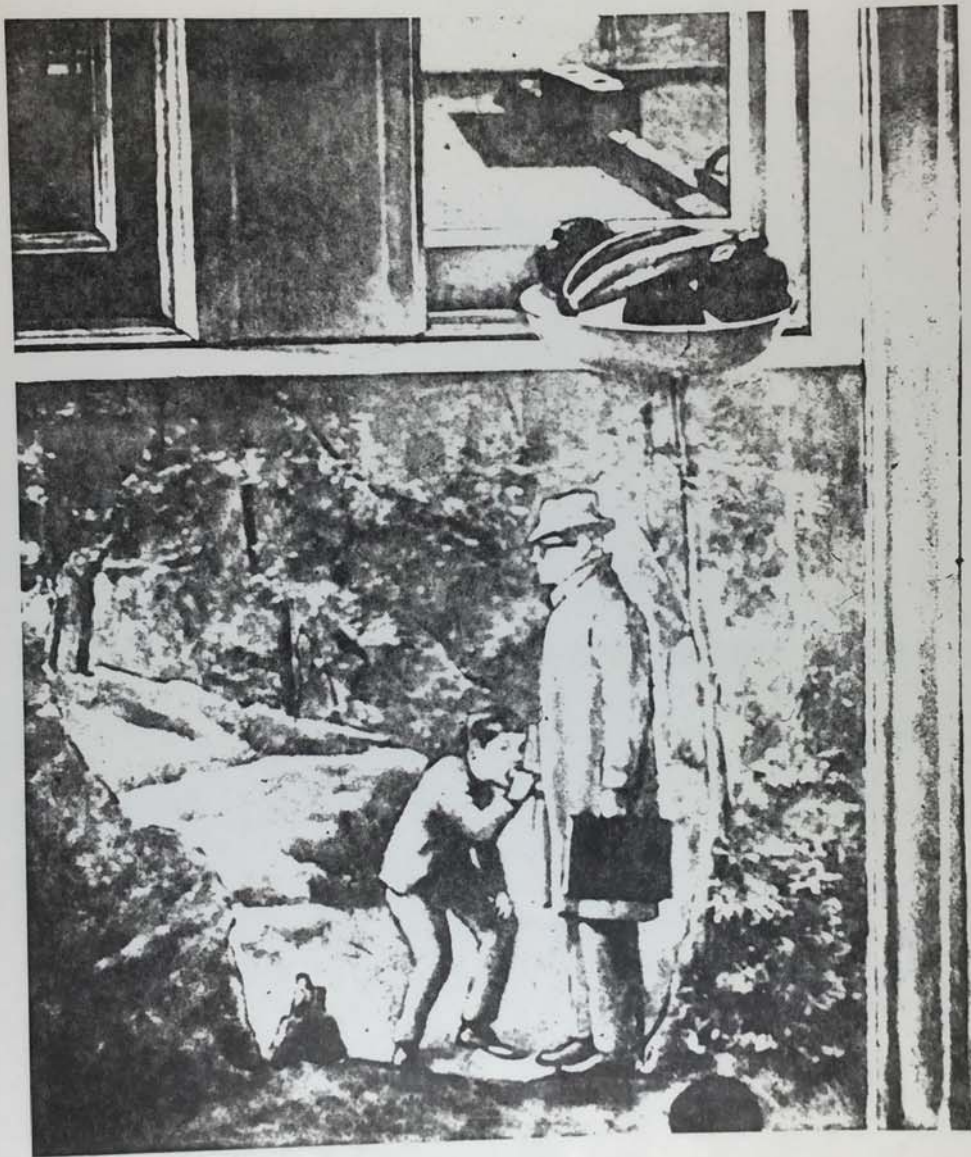
87 Milet Andrejevic untitled, 1967