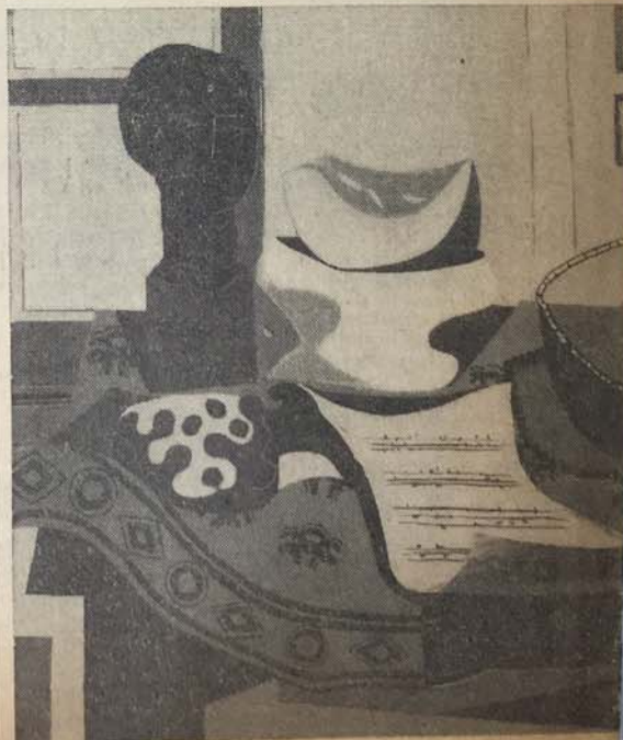
PICASSO—"Boy Leading a Horse" was painted in 1901 and calls El Greco. A detail from the anguish-laden mural "Guernica" (1937) is shown below.