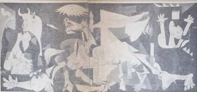
Upper: The 'Guernica' mural, illustrated in exhibition of paintings by Picasso, at the Museum of Modern Art (through September 7). Lower: A New York City 'War Relocation Authority' poster, designed by Joseph C. Anderson of the War Relocation Authority, showing a man and a woman in a boat, with the text 'SHARE THE LOAD' and 'UNITED STATES DEFENSE SAVINGS BONDS & STAMPS'.