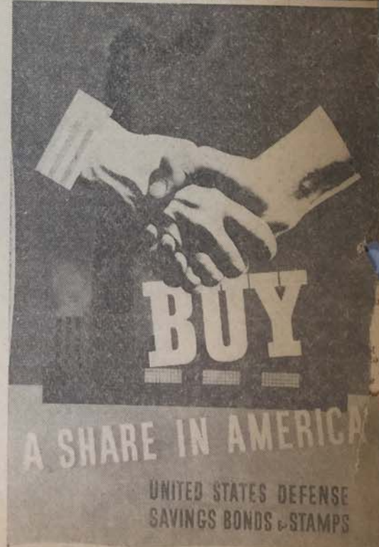
Upper: The 'Guernica' mural, illustrated in exhibition of painting. In exhibition of national defense posters, at the Museum of New York city, winner of $500 prize.