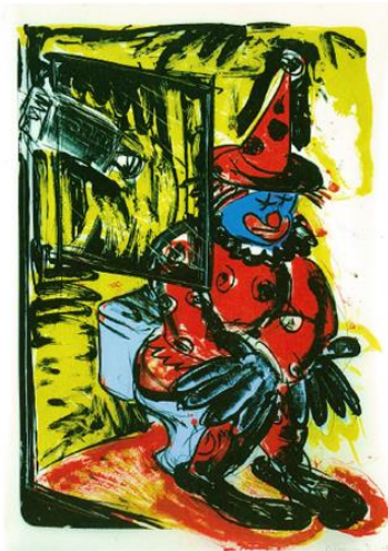
Bruce Nauman. Clown Taking a Shit . 1988. Lithograph, 42 x 30" (106.7 x 76.2 cm). Publisher: Brooke Alexander Editions, New York. Printer: Arber and Son Editions, Alameda, New Mexico. Edition: 35. Purchase. © 2016 Bruce Nauman/Artists Rights Society (ARS), New York