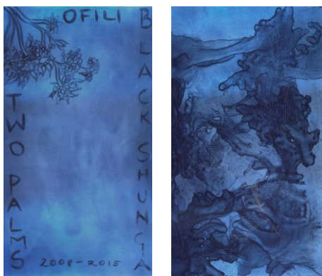
Chris Ofili. Black Shunga . 2008–15. Suite of 11 etchings with gravure on pigmented paper, each: 26 1/2 x 17 1/2" (67.3 x 44.5 cm). Publisher and printer: Two Palms Press, New York. Edition: 20. Purchase. © 2016 Chris Ofili.