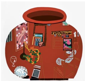
Jonas Wood. Matisse Pot 1 . 2014. Gouache and colored pencil on paper, 17 x 20" (43.2 x 50.8 cm). Gift of Michael Ovitz. © 2016 Jonas Wood.