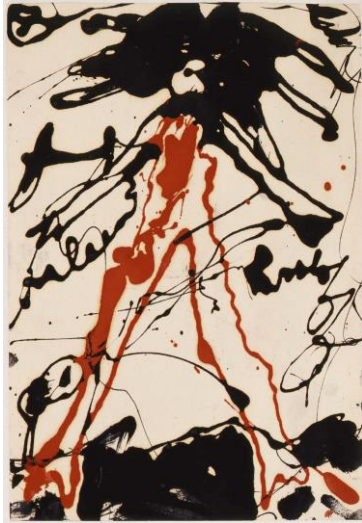
Claes Oldenburg. Striding Figure (Final Study for Announcement of a Dance Concert by the Aileen Passloff Dance Company) . 1962. Enamel on paper, 17 3/4 x 12 1/8" (45.1 x 30.8 cm). Purchase. © 2016 Claes Oldenburg.

Julio Plaza. Language (Linguagem) . 1970. Enameled metal plaque, 7 7/8 x 15 3/4" (20 x 40 cm). Latin American and Caribbean Fund