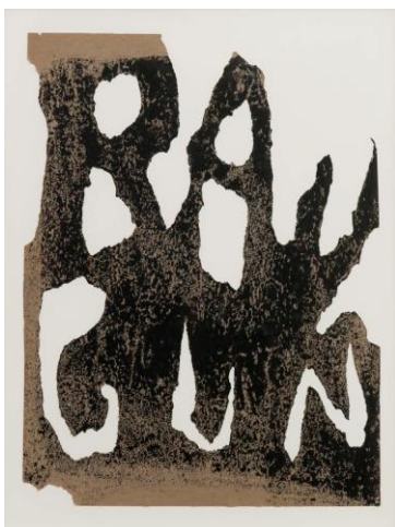
Claes Oldenburg. Ray Gun Poster . 1961. Spray oil wash on torn paper, 24 x 18" (61 x 45.7 cm). Purchase. © 2016 Claes Oldenburg.