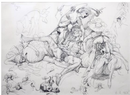
Claes Oldenburg. Clinical Study, towards a Heroic-Erotic Monument in the Academic/Comics Style . 1965. Ballpoint pen on paper, 26 x 40" (66 x 101.6 cm). Purchase. © 2016 Claes Oldenburg.