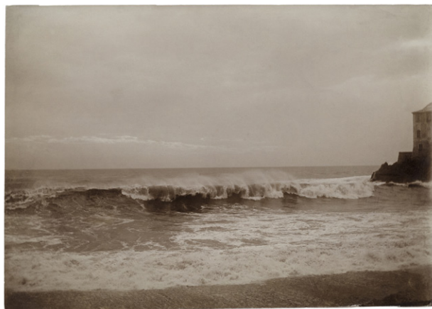
fig. 5 Stanisław Witkiewicz. The Sea in Carrara (Morze w Carrarze) . 1897. Toned bromide print, 4\frac{5}{8} \times 6\frac{1}{2} " (11.8 × 16.6 cm). Collection of Ewa Franczak and Stefan Okołowicz

Zakopane architectural style, who also practiced photography (fig. 5), producing mostly landscapes of the Tatras that served to complement his activity as a painter. 3 In the 1880s and 1890s, the elder Witkiewicz co-produced the Warsaw journal Wędrowiec (The wanderer), which promoted realist art, esteeming above all the accordance of the work of art with nature, a position that challenged the dominance of history painting and sought to propagate art based on the direct observation of the natural world. Although the journal concerned itself primarily with painting and literature, photography was discussed in its pages as well, mostly as a novel and promising alternative to sketching. Witkiewicz himself, fascinated by the possibilities of photography, took advantage of photographs as a starting point for the drawings he published in Wędrowiec . 4 He issued a few theoretical statements about the medium and its potential, too, with the best known perhaps appearing in 1903 in the book Dziwny człowiek (The strange man): "When the camera is perfected