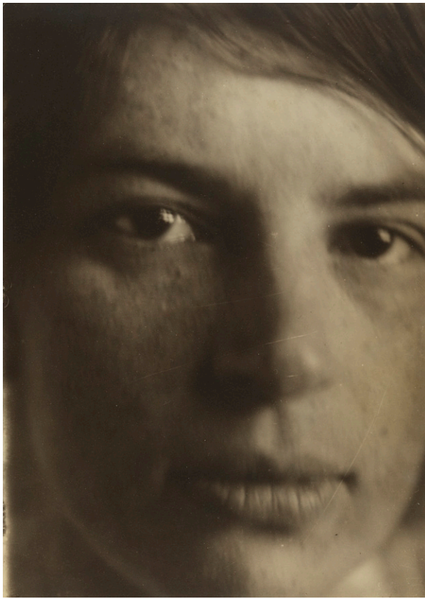
fig. 2 Stanisław Ignacy Witkiewicz (Witkacy). Helena Czerwijowska . c. 1912. Gelatin silver print, 6 7/8 × 4 7/8" (17.5 × 12.4 cm). The Museum of Modern Art, New York. Gift of Russell Lynes and Shirley C. Burden, by exchange