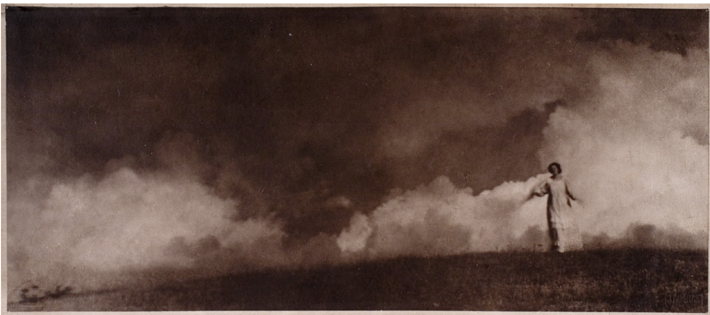
fig. 4 Jan Buthak. The Ghost (Duch) , also known by the title Out of the Cloud (W obłoku) . c. 1907. Toned bromide print, 3\frac{3}{4} \times 8\frac{11}{16} " (9.5 × 22 cm). National Museum, Wrocław, Poland