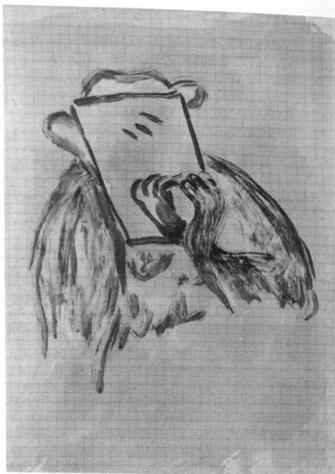
Untitled. 1984. Synthetic polymer paint and ink on graph paper, 11 x 8" (27.9 x 20.3 cm). The Museum of Modern Art, New York

Designed to present recent work by contemporary artists, the new projects series has been based on the Museum's original projects exhibitions, which were held from 1971 to 1982. The artists presented are chosen by the members of all the Museum's curatorial departments in a process involving an active dialogue and close critical scrutiny of new developments in the visual arts. The projects series is made possible by generous grants from the National Endowment for the Arts, the Lannan Foundation, and J. P. Morgan & Co. Incorporated.