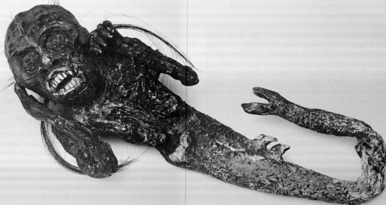
Detail of Untitled. 1987. Mixed mediums.

The sculptures in the present exhibition have an eerie and compelling presence. While they recall earlier work in form and medium, they signal a new direction that has developed out of the artist's interest in evolution and the origin of the human species. In some of the pieces presented here Trockel has replicated artifacts she has seen in reproduction or in archaeology and