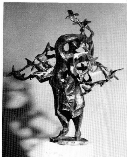
HADZI Bird Woman. 1954-55