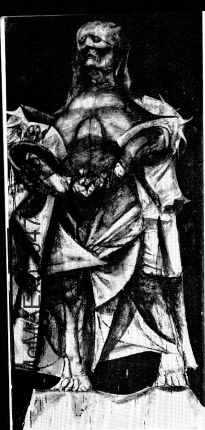
54. Woman of the Crucifixion Casein, masonite