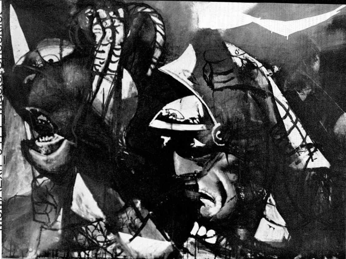
119. Soldiers with Flares Ink wash canvas