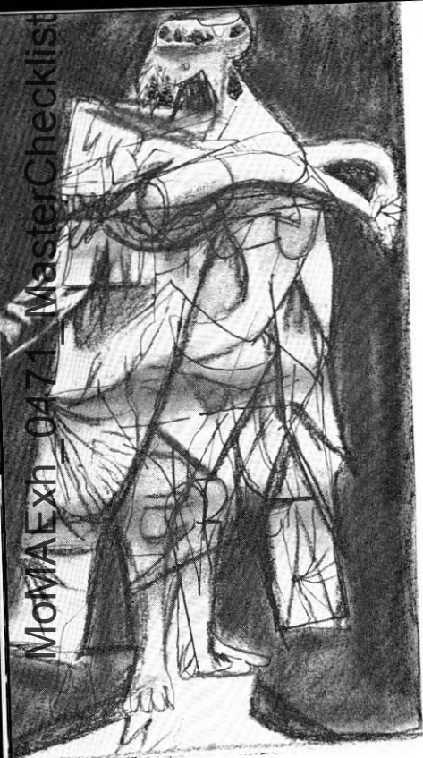
65. Woman of the Crucifixion 11\frac{1}{2} \times 6\frac{3}{4} [Profile] Pen and ink, black and brown conté