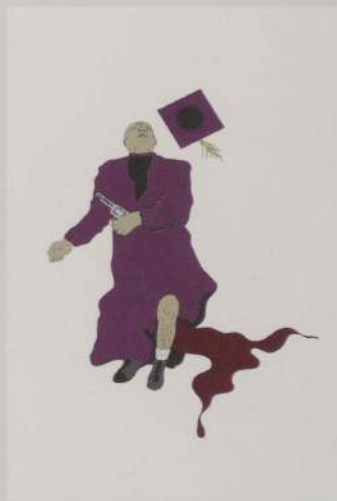
Deadman 1–5. 2003. Two from a series of five digital prints, each: 19 x 13" (48.3 x 33 cm). Publisher: the artist and Greene Naftali, New York. Printer: Silicon Gallery Fine Art Prints Ltd., Philadelphia. Edition: 5. The Museum of Modern Art, New York. Harvey S. Shipley Miller Fund, 2004