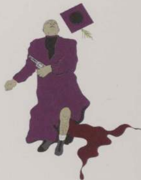
Deadman 1–5. 2003. Two from a series of five digital prints, each: 19 x 13" (48.3 x 33 cm). Publisher: the artist and Greene Naftali, New York. Printer: Silicon Gallery Fine Art Prints Ltd., Philadelphia. Edition: 5. The Museum of Modern Art, New York. Harvey S. Shipley Miller Fund, 2004