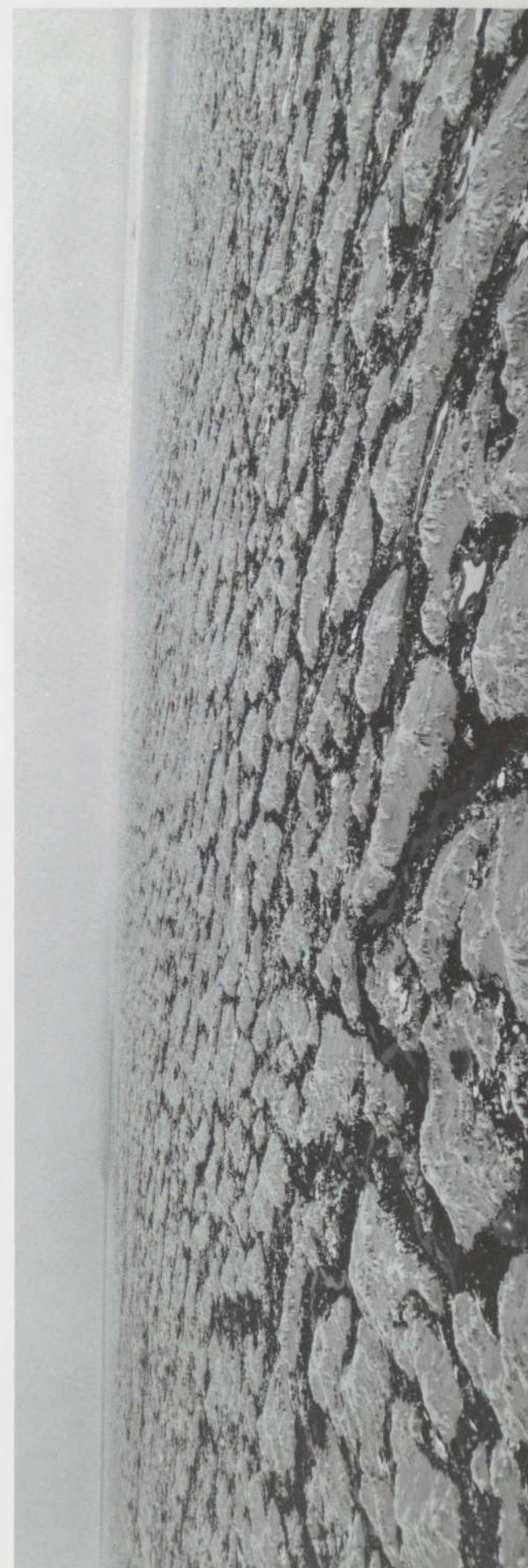
414/ "Dirty Ice," MacMurdo Ice Shelf, near Dailey Islands (shot from helicopter). From On Antarctica , 1989. Original in color

Peter Galassi Curator Department of Photography