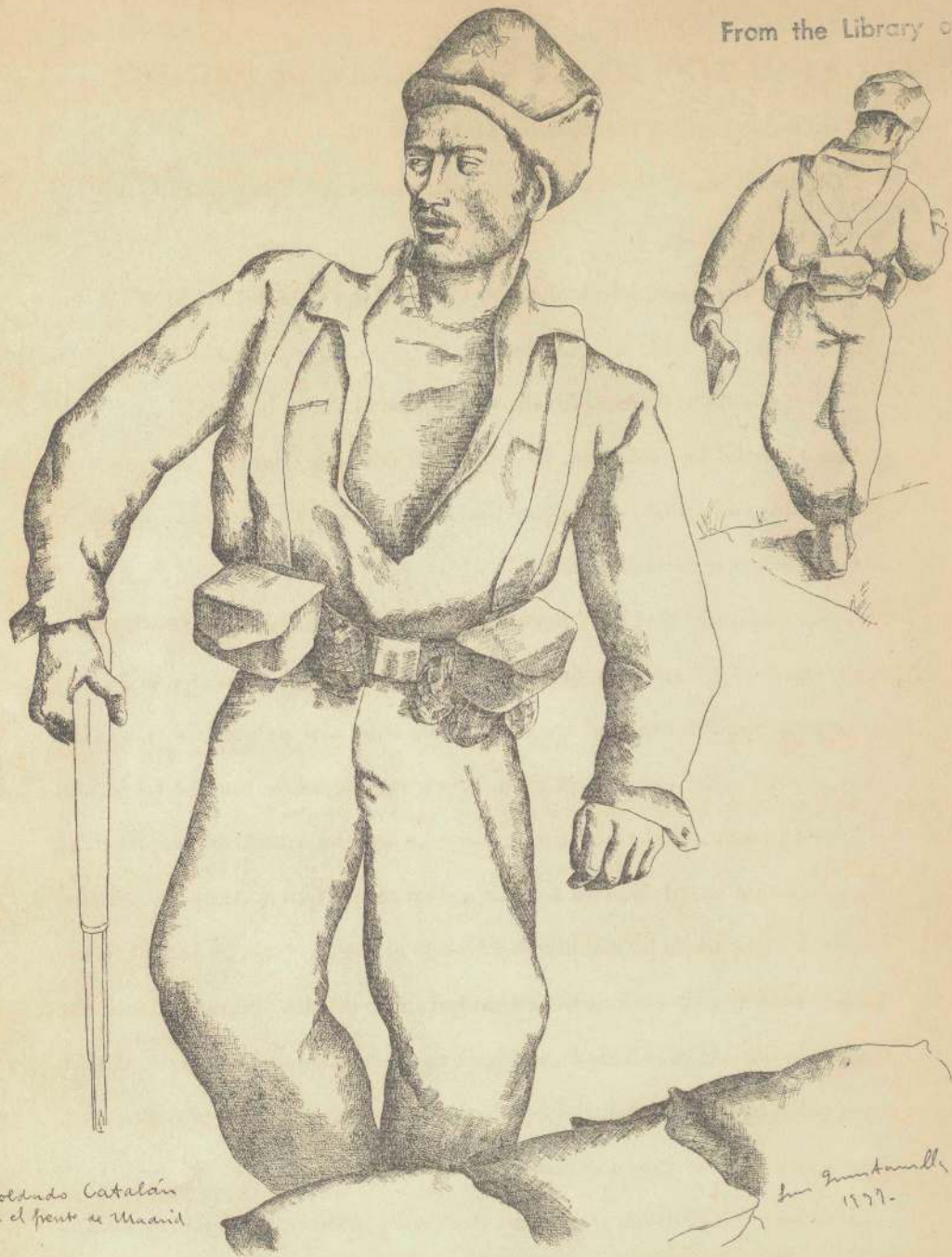
Soldado Catalán en el frente de Madrid