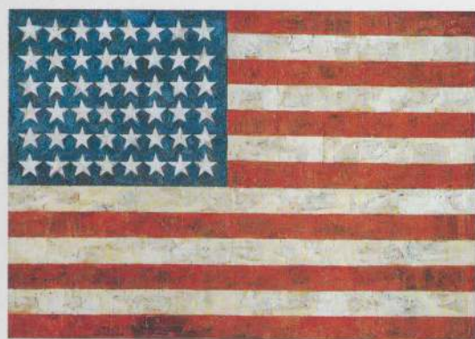
Flag. 1954–55. Encaustic, oil, and collage on fabric mounted on plywood (three panels), 42¼ x 60¾" (107.3 x 154 cm). The Museum of Modern Art, New York. Gift of Philip Johnson in honor of Alfred H. Barr, Jr.

From the mid-1950s, Johns’s work alloyed cool logic and private compulsion. His breakthrough 1954–55 painting Flag instigated a series of paintings of the American flag and of targets. When Johns made these paintings, he was interested in what he later described as “pre-formed, conventional, depersonalized,