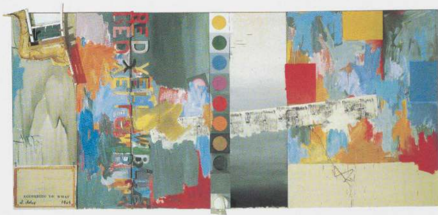
According to What. 1964. Oil on canvas with objects (six panels), 7' 4" x 16' (223.5 x 487.7 cm). Private collection.

In 1964, a trip to Japan provided the occasion to advance his assemblage aesthetic. While in Tokyo, Johns made the two Souvenir pictures (which include his first explicit likenesses of himself) and Watchman (using a partial body cast for the first time since the early target paintings). The latter involves a rumination on modes of visual attentiveness that, as Johns penned in a sketchbook note, specifically refers to the differences between a "watchman" and a "spy." Arrive/Depart (1963–64), still marked with his painterly style of the early 1960s, introduced some of the elements now in play; it contains Johns's first use of the human skull motif, printed directly from an actual skull, and of the screen-print technique. The summation of this period of work is the programmatic According to What (1964); consciously lacking a focal point of reference, this huge reprise of earlier works joins a broad variety of modes of representation in homage to Duchamp.