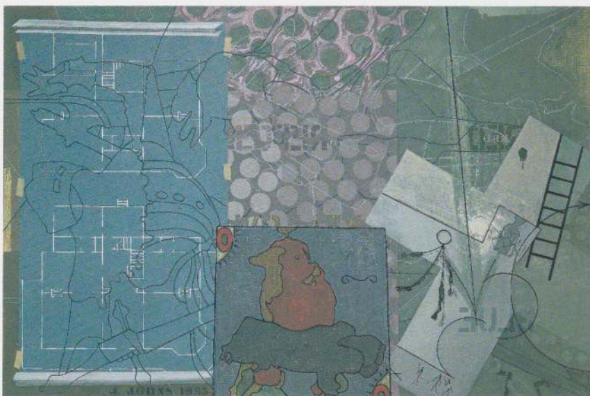
Untitled. 1992-95. Oil on canvas, 78 x 118" (198.1 x 299.7 cm). The Museum of Modern Art, New York. Promised gift of Agnes Gund.

In 1992-95, when Johns conceived a closely related pair of exceptionally large untitled canvases, these elements, plus the unidentified traced motif, a cruciform shape from the 1990 etching The Seasons , and the linear contours of a soldier from the Grünewald altarpiece, were all "laid over" the reversed imagery of the three-part Untitled (Red, Yellow, Blue) of 1984. Looking back beyond earlier "tackboard" pictures like Racing Thoughts (1983) to previous milestone works such as According to What (1964), or the large, four-panel Untitled (1972), this grand, summary pair of untitled canvases seem newly dematerialized and synthetic in their weaving together of disparate motifs. Dreamlike in the variety of their floating juxtapositions, they reformulate and synthesize, in Johns's sixty-fifth year, the conundrums of picture-making and the concerns with time, memory, personal history, and art history that have continued to absorb the changing focus of his eye.