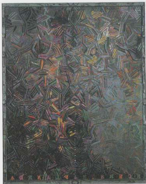
Dancers on a Plane. 1980. Oil and acrylic on canvas with painted bronze frame, 78 \frac{3}{4} x 63 \frac{3}{4} " (199 x 161.9 cm), including frame. Tate Gallery, purchased 1981.

Following his 1977–78 traveling retrospective, Johns painted the last of the cycle of cross-hatch abstractions that he had begun in 1972. One has the sense in the later works of this kind that the motif's kaleidoscopic dynamism is locking up, with intensifying rigidity and constriction. The shift began to occur with the two Dancers on a Plane paintings of 1979–80. Figurative references and eating utensils are grafted to the cross-hatch abstraction. Johns has said that when he made the first Dancers on a Plane painting, he was "thinking about issues like life and death, whether I could even survive. I was in a very gloomy mood when I made the picture, and I tried to make it in a stoic or heroic mood." The paintings can be connected with his fascination at the time with Tantric art. The utensils in both versions introduce associations for him of "cutting, measuring, mixing, blending, consuming—creation and destruction moderated by ritualized manners."