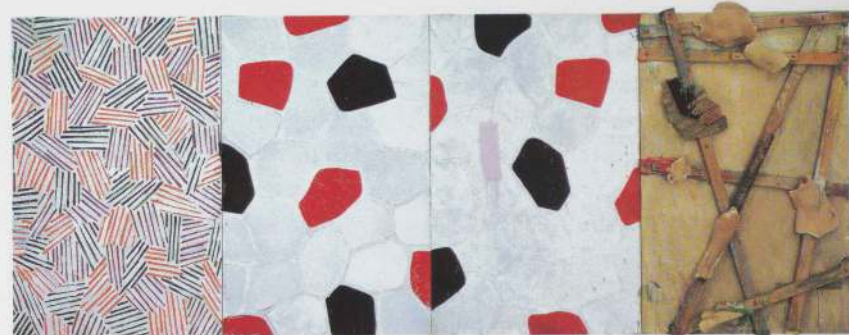
Untitled. 1972. Oil, encaustic, and collage on canvas with objects (four panels), 6' 1/8" x 16' 1" (183 x 490 cm). Museum Ludwig, Ludwig Donation, Cologne.

From the mid-1960s to the early 1970s, Johns's work became still more eclectic. His production of paintings slowed while his printmaking flourished. He became more experimental, using screenprints, photographic reproductions, neon, and metal, as well as more familiar studio materials. He explored altered formats and variable scales, and produced some of the largest works of his career—both spare abstractions and packed, complex constructions with multiple references. In 1967, a painted flagstone pattern that Johns had glimpsed on a wall while driving through Harlem gave him a new motif, more abstract and more random in structure than the found schemas and maps of previous years. The first such image he reconstructed from memory, this flagstone pattern became the focus for systematic experiments in visual inversion, reversal, and overlap—experiments he would expand upon in the next decade. Surrounded