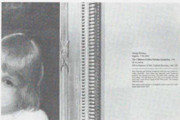
Fragment/Frame/Text: "The Younger Child Died Early." 1984. Cibachrome print, 13 \frac{1}{4} x 19 \frac{1}{2} " (33.7 x 49.5 cm)

I am showing what they are showing: painting, sculpture, pictures, glasses and words on painted walls furnishing the same material experience; my work is to exchange the positions of exposition and voyeurism. You are standing in your own shoes.