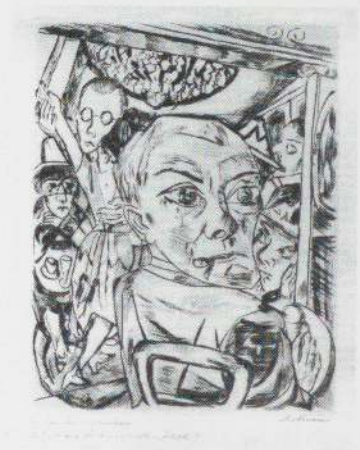
Queen Bar (Self-Portrait), 1920

tual concerns of earlier German Expressionism and instead represented with painstaking reality the horrors of World War I and the instability of its aftermath. Beckmann, how-