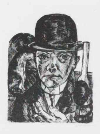
Self-Portrait in Bowler Hat, 1921

The three self-portraits illustrated here, all produced in Frankfurt after Beckmann's harrowing experience serving in the war and during his most prolific printmaking period, picture the artist in multiple identities and settings. In Queen Bar (Self Portrait) (1920) Beckmann places himself in an awkward three-quarter