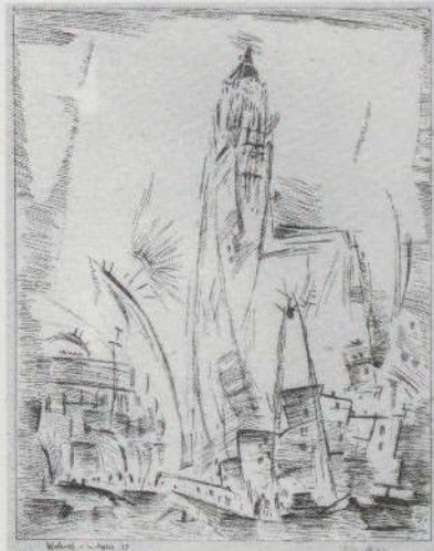
WOOLWORTH BUILDING NO. 2, 1913