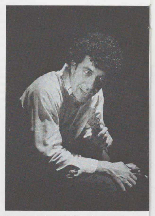
Eric Bogosian. Sex, Drugs, Rock & Roll. Orpheus Theater, New York. February 1990.

A spectrum exists from the lowest of "low" culture (naked women mud-wrestling; troll