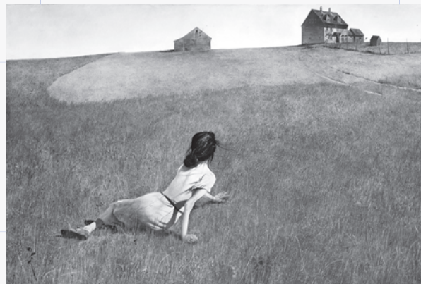
Andrew Wyeth. Christina's World . 1948

Piet Mondrian (1872–1944) made art intimately related to his spiritual and philosophical studies. In his work he sought to transcend specific subject matter to represent the universal. Over the course of the development of his aesthetic doctrine, called Neo-Plasticism, he gradually limited his compositions to what he considered “pure” forms—horizontal and vertical lines—resulting in a strict rectilinearity and a palette of black, white, and primary colors exclusively. In 1940 Mondrian moved to New York City, where he would remain until his death. He took great interest in city life and jazz music, to which he was introduced in New York, and he soon began, as he said, “to put a little boogie-woogie” into his paintings.