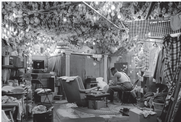
Jeff Wall. After “Invisible Man” by Ralph Ellison, the Prologue . 1999–2000