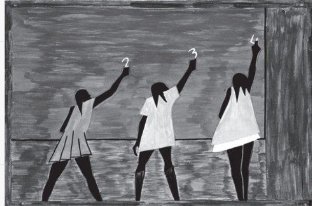
Jacob Lawrence. In the North the Negro had better educational facilities . 1940–41

Edward Hopper (1882–1967) studied illustration and painting at the New York Institute of Art and Design, where he and his fellow students were encouraged to create realistic depictions of modern life. Because abstraction reigned supreme then, many critics considered Hopper and his colleagues to be painting in a style that was all but obsolete. Eventually, though, his work came to be considered an important precursor to a generation of Pop artists and Photo-Realist painters. Most of Hopper’s paintings concentrate on the subtle interactions of human beings with each other and/or their surroundings.