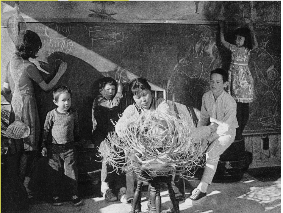
Ruth Asawa and her children in the sunroom of her San Francisco home, California, 1964.

As an adult, Asawa taught art in schools. She was also a mother and made art in her home studio alongside her six children.