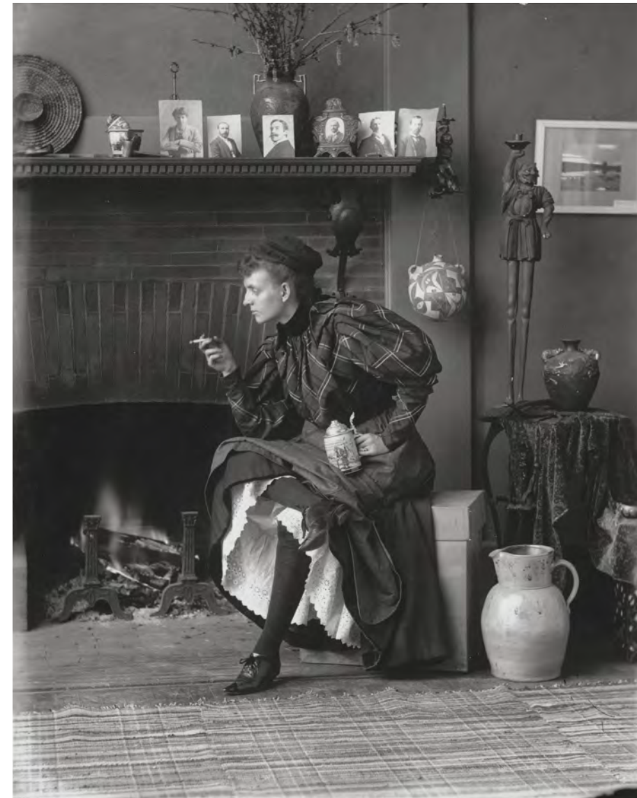
Fig. 1. FRANCES BENJAMIN JOHNSTON Untitled (self-portrait in her Washington, D.C., studio). 1896 Gelatin silver print, 7 3/4 x 6 3/16 in. (19.7 x 15.7 cm)

Her accomplishments did not go unnoticed. In 1895, The Washington Times noted: "Miss Frances Benjamin Johnston is the only lady in the business of photography in the city, and in her skillful hands it has become an art that rivals the