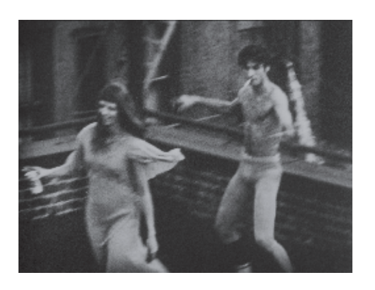
ANDY WARHOL AT JUDSON THE ROY AND NIUTA TITUS THEATER 2

The following works are performed: ACCOMPANIMENT FOR LA MONTE'S "2 SOUNDS" AND LA MONTE'S "2 SOUNDS," CENSOR, HUDDLE, PLATFORMS, SLANT BOARD. On selected dates SEE SAW will also be performed, with special guests.