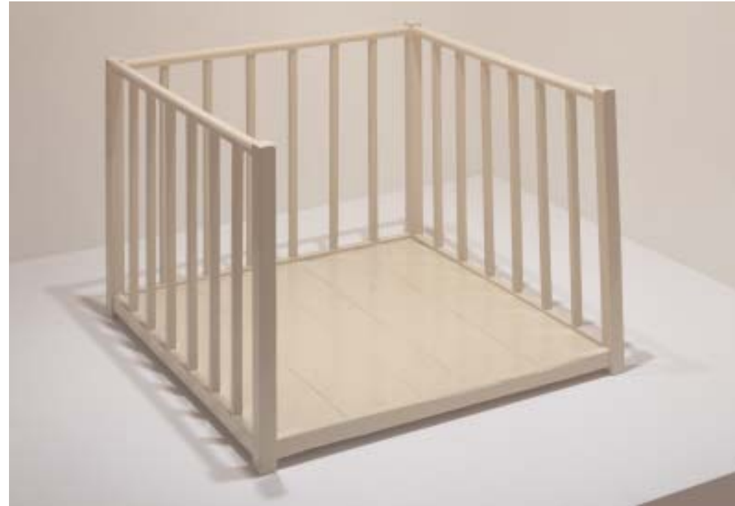
Robert Gober. Open Playpen . 1987. Enamel paint on wood, 25 1/2 x 35 3/4 x 35 3/4" (64.8 x 90.8 x 90.8 cm). Gift of Werner and Elaine Dannheisser. © 2003 Robert Gober

The next room is one I am referring to as the “subversive grid room,” with mainly the work of two artists: Ellen Gallagher and Yayoi Kusama. Gallagher's very large grid painting titled They Could Still Serve , 2001, uses the modernist device of the grid but introduces tiny, cartoonlike symbols depicting African American