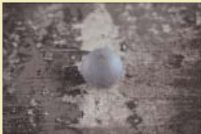
Gabriel Orozco. CCCP . 1993. Silver dye bleach print (Cibachrome), 12½ x 18½" (31.7 x 47 cm). The Family of Man Fund

For more information about Public Programs, please call (212) 708-9781 or (212) 247-1230 (TTY), or visit www.moma.org/momalearning .