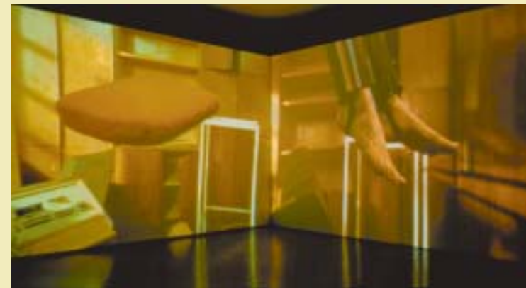
FRONT COVER: Ellen Gallagher. Untitled. 2000. Oil, pencil, and plasticine on magazine page, 13 1/4 x 10" (33.7 x 25.4 cm). Gift of Mr. and Mrs. James Hedges, IV. © 2003 Ellen Gallagher