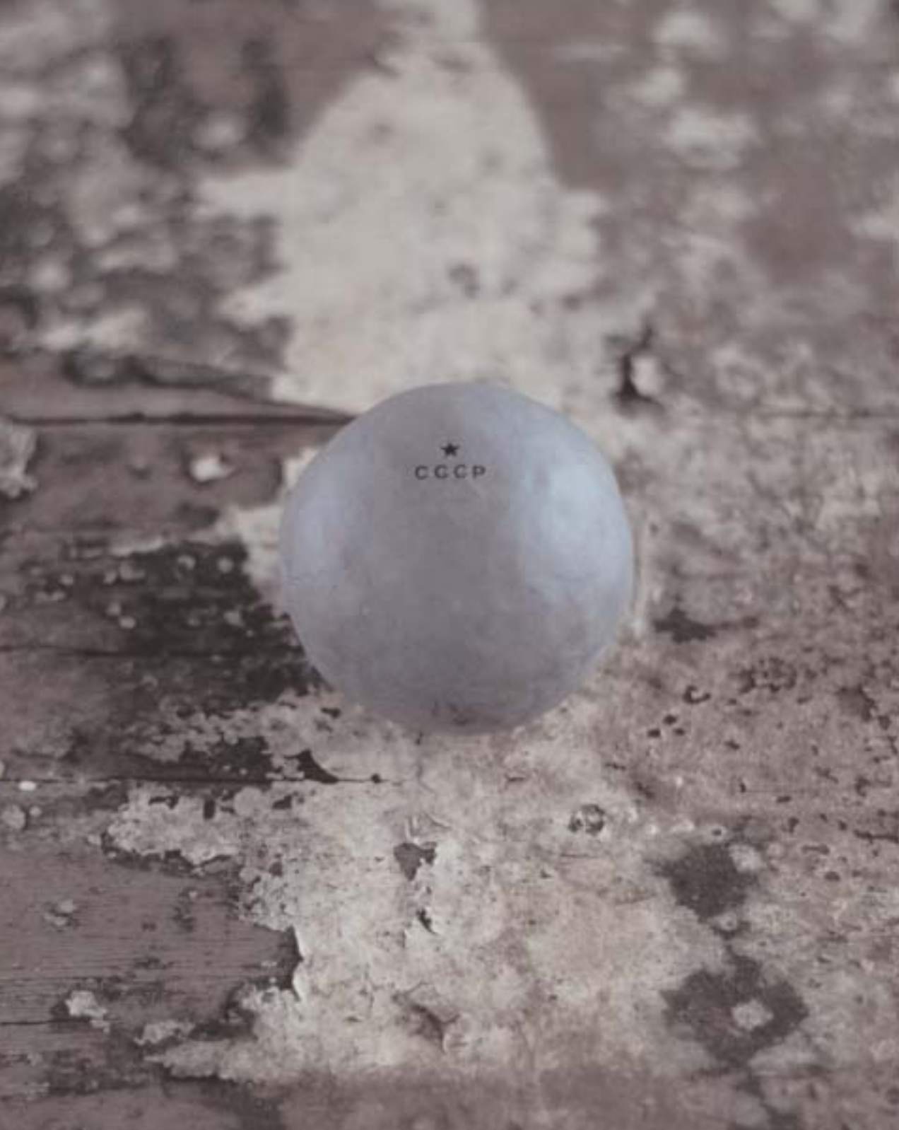
The Museum of Modern Art