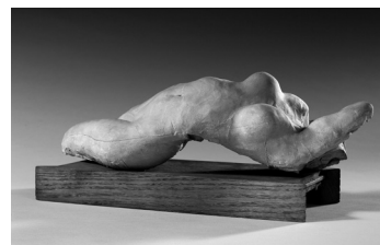
Auguste Rodin. Torso of Adèle . Before 1884. Terracotta, 4 9 / 16 × 14 3 / 4 × 6 7 / 16 " (11 × 37.5 × 16.4 cm). Photo by Christian Baraja. Courtesy Musée Rodin

Hassabi's work is filled with the tension between abjection and exaltation. She describes her references in a string of incongruous associations: "junkies in the middle of the street . . . luxurious figures at rest . . . a person forgotten in a corner of the city . . . people simply staring, sitting, standing." 10 What unifies these figures is their unproductiveness: they are avatars of what appears to be a breakdown in