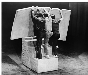
Yvonne Rainer. Stairs. 1968. From The Mind Is a Muscle.

He breathes and his muscles tremble. You see tears well up in his left eye as his muscles quiver. He squints. The tremors and quakes are not signs of weakness or vulnerability; they are nonverbal, involuntary surface messages about the physical effects of time and arduous activity on the body. While these gestures may look like pain, they are the dancer's nervous system communicating the physical effects of the duration of gravity and downward motion to anyone who might look long enough to see them. 12 Perhaps you'll have an encounter with the performer; maybe you'll disregard him. But if you glance at the dance, if you become part of it, you might see something made familiar within its loop.