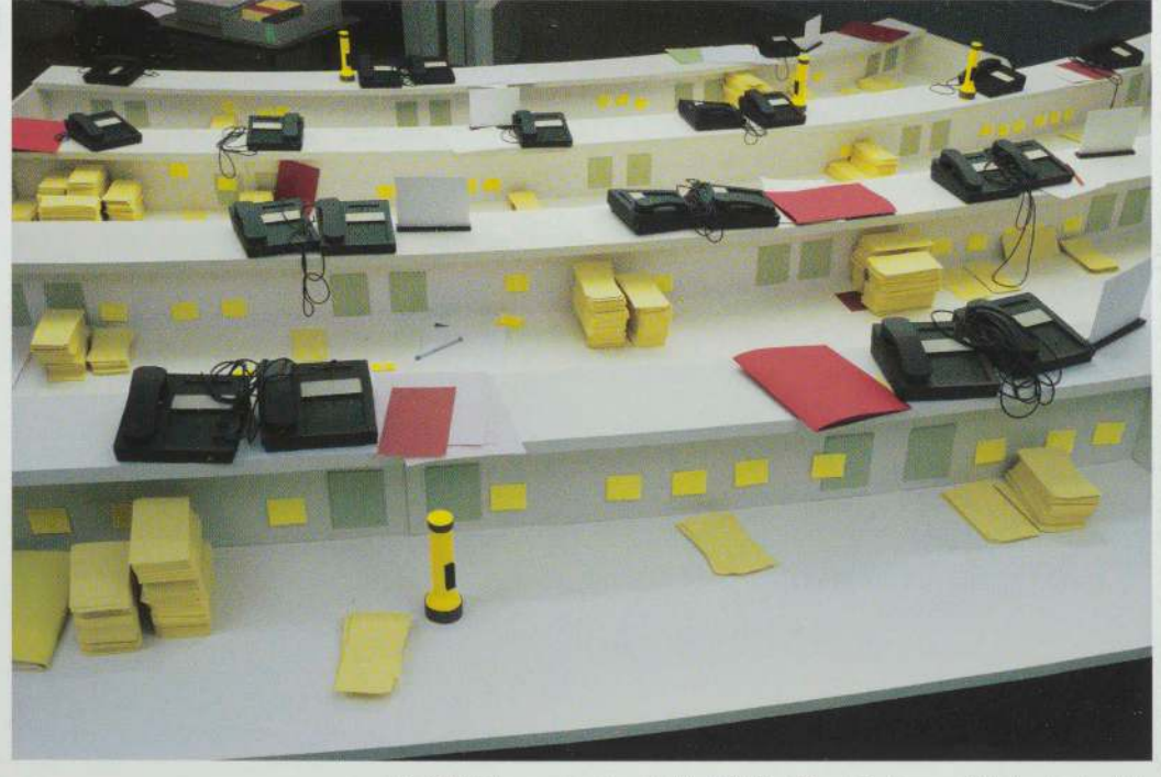
4. Poll. 2001. Chromogenic color print, 71" x 8"6" (180 x 260 cm). The Museum of Modern Art, New York. Fractional and promised gift of Sharon Coplan Hurowitz and Richard Hurowitz

Given the cinematic quality of Demand's photographs, it is not surprising that he decided to set some of them in motion, producing to date five 35mm films. His most recent film, Trick, of 2004 (fig. 3), refers back to the beginnings of cinema. Based on one of the first films of the Lumière brothers, Turning Plates, of 1896, Demand's Trick reenacts a sequence in which a performer executes a stunt by spinning a set of bowls and plates on a tabletop. What comes into view in this—as in all of Demand's works is an afterimage of a situation, an event, or a place that continues to bewilder us with its presence long after its original manifestation has disappeared from the scene. In an era when even the most sensationalist stories have only a brief shelf life, Demand's photographs and films offer a paradigm for memory premised on a new way of looking at what is presented to us as "truth."