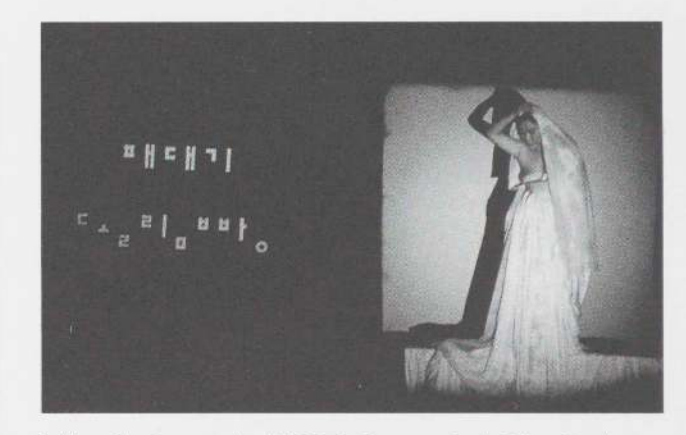
Bul Lee. Diet: Programming III. 1992. Performance, Sagak Gallery, Seoul.

Sewn sculptures of body parts, mostly oversized buttocks, breasts, and vaginas, predominated in Lee's early work. Some pieces stood alone as objects, and others she appliqued and wore. In a provocative action, Lee flew into Tokyo's Narita Airport with cloth fetuses and entrails hanging from her dress. Security detained her only briefly, and she continued her outrageous performance on the fashionable streets of Ginza and at the Meiji Shrine.