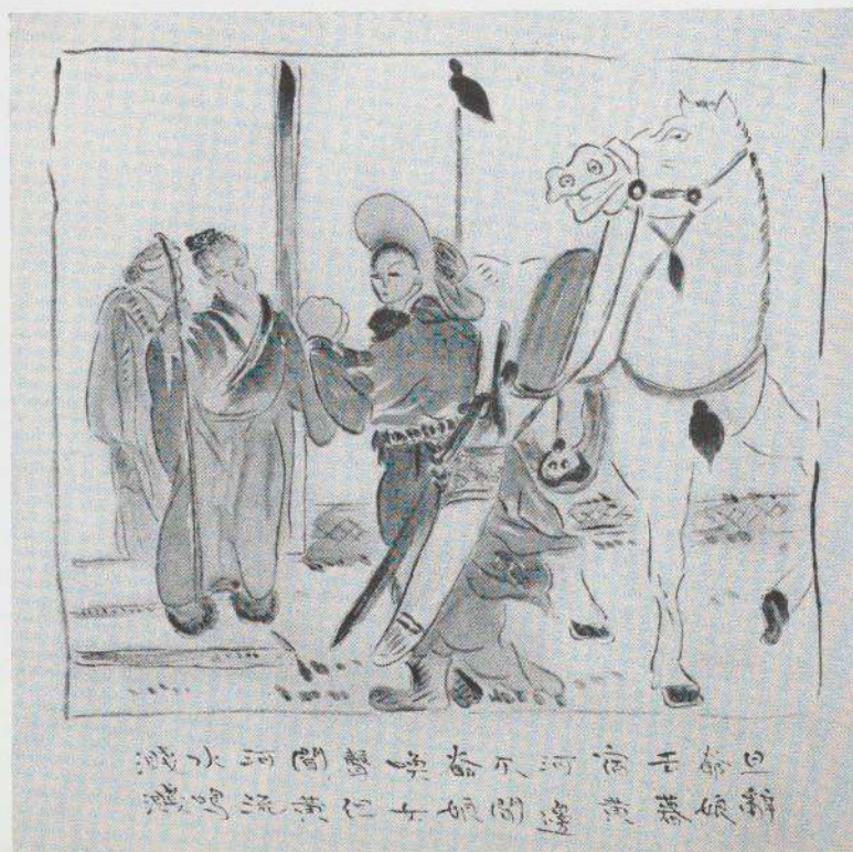
Mu Lan Goes to the Army.

Any child in Russia, Europe, or England, might do the counterpart of the exultant drawing, "Fujiyama Next Year," with Allied planes filling the skies and the enemy landscape trembling in apprehension. A war child of the West would also know, as instinctively as the Chinese child, that a black line drawn along the hollow of the cheek is enough to describe hunger, and that people with empty stomachs seldom stand.