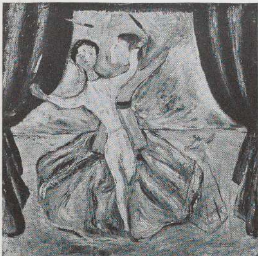
Felipe Orlando. Circus . 1941. Oil. 12 x 12".

COURTYARD. 1943. Gouache, 17 \frac{7}{8} x 11 \frac{7}{8} ".