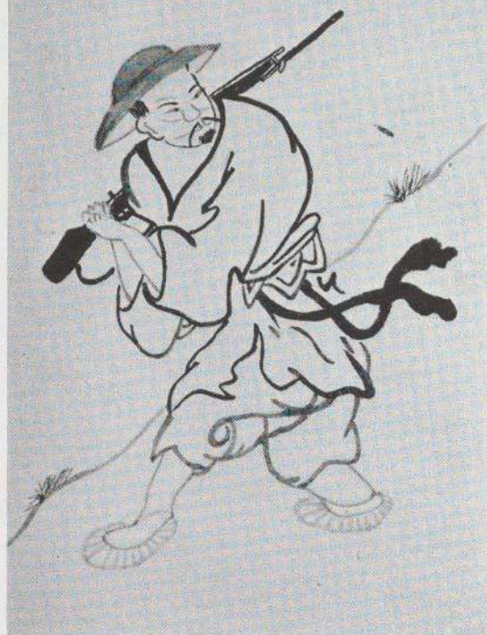
Going to Battle.

acters for "portrait painting"—"Hsien Chen"—meaning literally "To write truth." It also shows the sharp impression made by posters which in turn, have been influenced by Russian work.