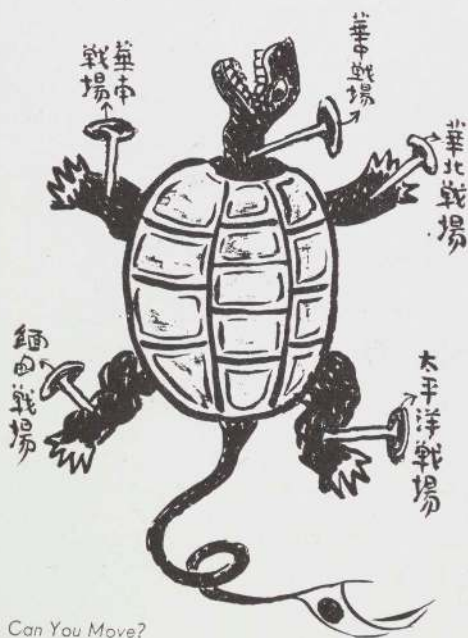
Can You Move?

Most outstanding trait of all in these pictures, is the marvelous sense of the shape and weight of spaces. The single figure in "Going to Battle," done in traditional decorative style with the modern touch included by adding a rifle on the shoulder of the volunteer swathed in flowing robe, has been unerringly placed on the paper. Admiration is demanded, too, by the scale in the drawings by a seven-year-old showing the movement of crowds.