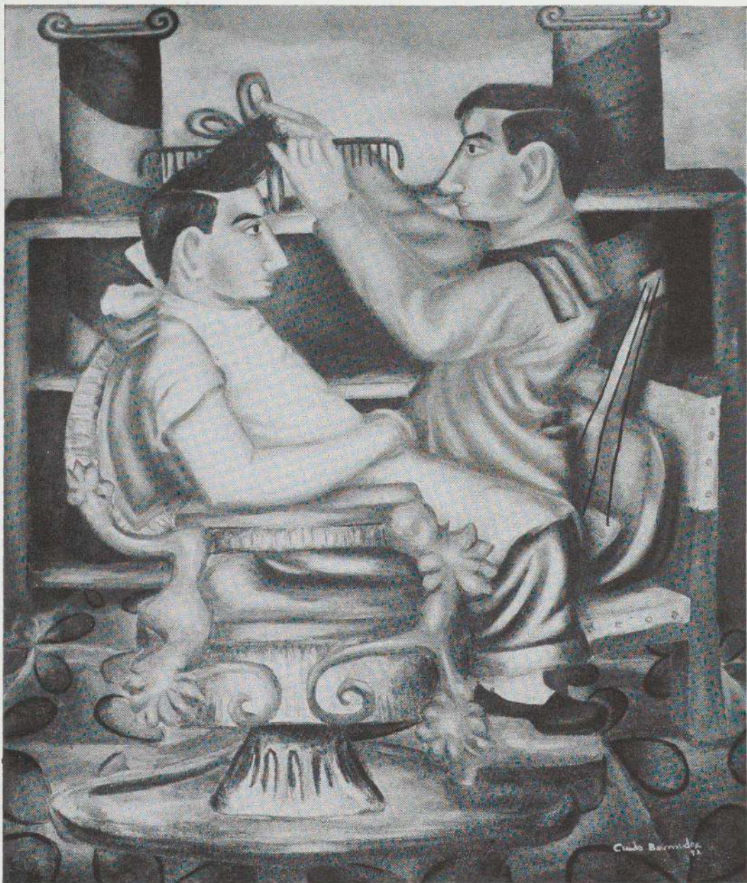
Cundo Bermúdez. Barber Shop . 1942. Oil. 25 x 21 1/8". In his droll, archaic figures, Bermúdez has interpreted certain unpretentious fellow-citizens described in his own words as "the man who does his job or plays his viola or the woman who walks absentmindedly and sits down on a bench . . ." Here are two of them surrounded by the strong color and fanciful polychromy still found in the old-fashioned barber shops in the outskirts of Havana.