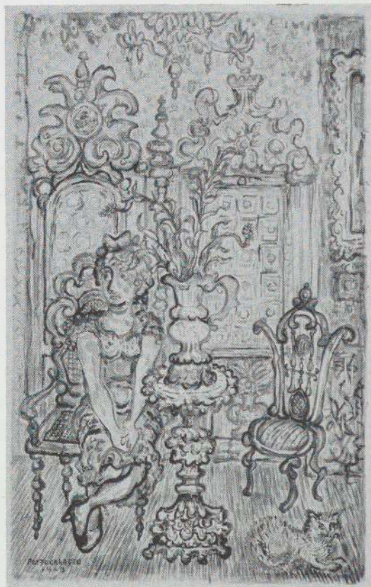
Portocarrero. Interior . 1943. 21 7/8 x 14".