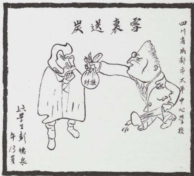
Giving Charcoal in Snowy Weather.

Apart from this series, the drawings seem unintentionally to carry out with amazing ease what painters in China have been taught for centuries—the principle of "rhythmic vitality"—which states that the painter should be attuned to the rhythm of the universe and be able to express the movement of life. These children seem to be turning around to say to the old masters: "See. We have managed to do so." And one eleven-year-old, whose picture of Roosevelt handing a bundle to Stalin illustrates American aid to Russia, could point to his work and add: "See, too, I can give a title in the old style—'Giving Charcoal in Snowy Weather'—without changing what I want to put in my picture."