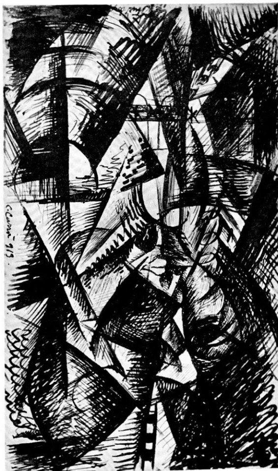
CARRÀ: The Milan Galleria (see page 128).