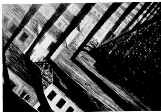
RUSSOLO: The Revolt , 1911. Not in the exhibition.

Born near Venice, 1885. Original member of the Futurist group, and signed the artists' famous inaugural manifesto at Milan, 1910. Worked as painter and also interested in the musical side of Futurism; invented a "sound machine" on which the operator could produce those cacophonous