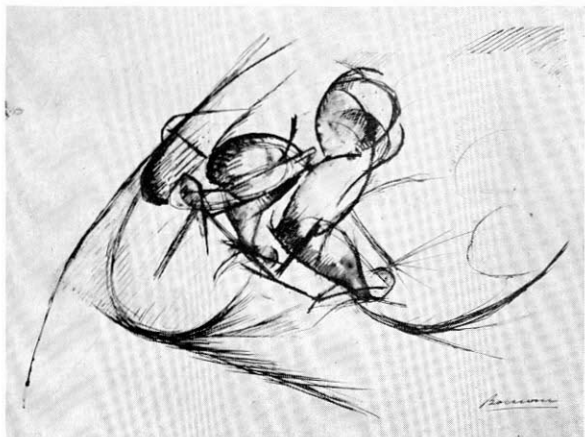
BOCCIONI: Study for the Dynamic Force of the Cyclist (see above).