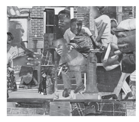
IMAGE SIX: Romare Bearden. American, 1911–1988. The Dove. 1964. Cut-and-pasted printed paper, gouache, pencil, and colored pencil on board, 13 % x 18 ¾" (33.8 x 47.5 cm). Blanchette Hooker Rockefeller Fund, 1971. © 2008 Romare Bearden Foundation/ Licensed by VAGA, New York, N.Y.