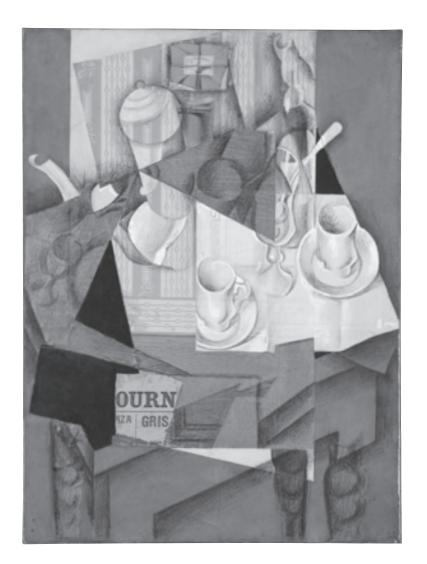
IMAGE FIVE: Juan Gris. Spanish, 1887–1927. Breakfast . 1914. Gouache, oil, and crayon on cut-and-pasted printed paper on canvas with oil and crayon, 31 ½ x 23 ½" (80.9 x 59.7 cm). Acquired through the Lillie P. Bliss Bequest. © 2008 Artist Rights Society (ARS), New York/ADAGP, Paris