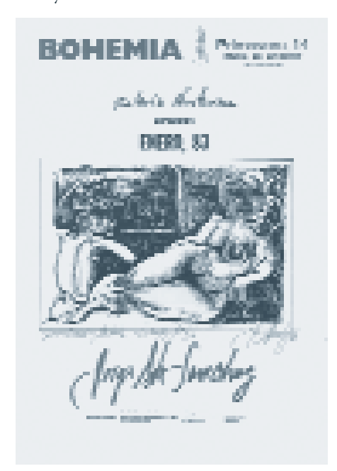
Poster for Jorge Soto's exhibition at Galería Nocturna, Madrid, 1983. 18 ^3/_{16} x 13 ^1/_{4}

also in Puerto Rico. Although El Centro Library and Archives is best known for its holdings in history, literature, sociology, and cultural anthropology, its holdings documenting the visual arts are of comparable strength. Outstanding sources on this topic include current and out-of-print art historical publications, drawings, and prints by renowned Nuyorican and Puerto Rican artists, the films produced by the 1950s DIVEDCO, and a growing collection of artist files. The Center for Puerto Rican Studies is one of the few places in the city where these materials are catalogued and readily accessible.