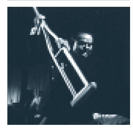
The Krutch. 2005. Directed by Judy Escalona. Archives of PR Dream

161 East 106th Street New York, NY 10029 Tel. (212) 828-0401 http://www.prdream.com http://www.medianoche.us