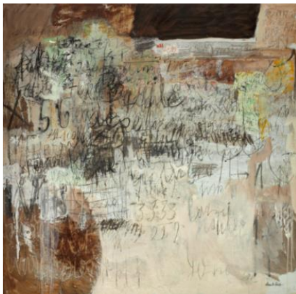
Sarah Grilo. ADD . 1965. Oil on canvas, 59 13/16 x 59 13/16" (152 x 152 cm). © Estate of Sarah Grilo.