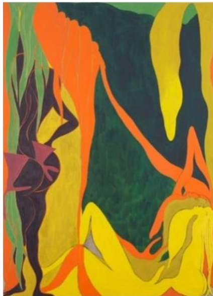
Chris Ofili. The Raising of Lazarus . 2007. Oil and charcoal on canvas, 109 3/4 x 79" (278.7 x 200.7 cm). © 2016 Chris Ofili.