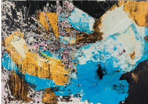
Mark Bradford. Let's Walk to the Middle of the Ocean . 2015. Torn and pasted papers, shellac, and oil on paper on canvas, 102 x 144" (259.1 x 365.8 cm). © 2016 Mark Bradford.