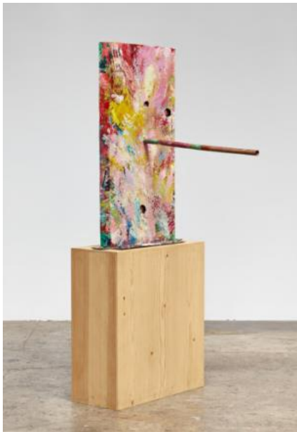
Mark Grotjahn. Untitled (The Skies Remembered II, French Mask M31.e) . 2014. Oil on bronze on wood pedestal, 47 7/8 x 31 x 39" (121.6 x 78.7 x 99.1 cm). © 2016 Mark Grotjahn.