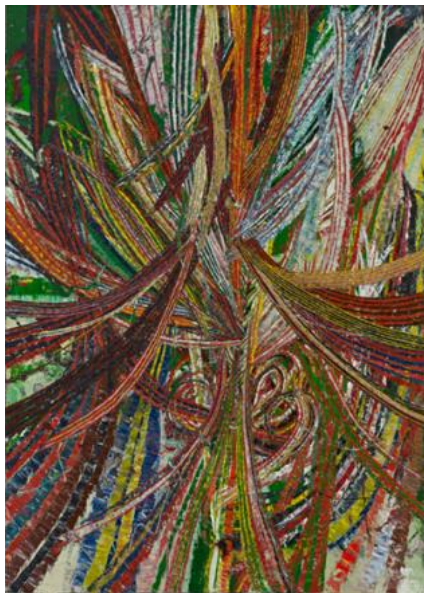
Mark Grotjahn. Untitled (Circus No. 1 Face 44.18). 2012. Oil on cardboard mounted on linen, 8' 5 1/2" x 72 1/2" (257.8 x 184.2 cm). © 2016 Mark Grotjahn.