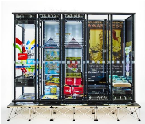
Simon Denny. Modded Server-Rack Display with Some Interpretations of David Darchicourt Designs for NSA Defense Intelligence . 2015. UV prints on Revostage platforms, powder coated 19" server racks, Cisco Systems WS-C2948G switches, LAN cables, Bachmann power strips, HP ProLiant DL380 G5 servers, steel trays, Plexiglas and aluminum model, Maisto Humvee 1:18 model car, vinyl and plexiglass letters on plexiglass, prints on cardboard puzzle and laminated cardboard box, Picard steel tool box, screwdrivers, hammer, painting brush, wrench, socket wrench, bits, saw, UV prints on plexiglass, Tamiya 1:48 U.S. Modern 4x4 Utility Vehicle with Grenade Launcher model cars and figures, CNC/routed MDF, VisiJet PXL ColorBond 3D print, UV print on Alu-Dibond, Fisso Steel stainless steel spacers, anodized aluminum panel, embossed gilded brass medallion, laser-cut plexiglass letters, powder-coated steel and aluminum components, UV print on sandblasted laminated safety glass, LED strips, 100 1/5 x 118 1/10 x 39 3/8" (254.5 x 300 x cm). © 2016 Simon Denny. Photo courtesy the artist and Petzel, New York. Photo: Nick Ash