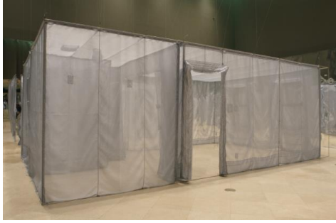
Do Ho Suh. 348 West 22nd St., Apt. A New York, NY 10011 at Rodin Gallery, Seoul/Tokyo Opera City Art Gallery/Serpentine Gallery, London/Biennale of Sydney/Seattle Art Museum/Smith College Museum of Art, Northampton/North Carolina Museum of Art. 2000. Translucent nylon, 169 1/4 x 271 5/8 x 96 1/2" (429.9 x 689.93 x 245.11 cm). Edition: 2/3. © 2016 Do Ho Suh.