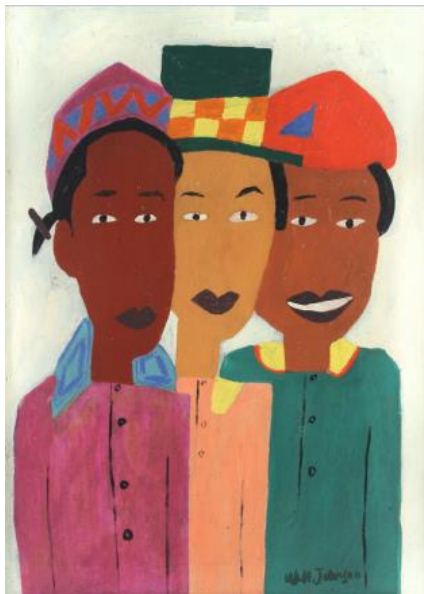
William H. Johnson. Three Girls . 1941. Oil and pencil on wood panel, 17 1/2 x 12 1/2" (44.5 x 31.8 cm). © 2016 Johnson Estate.