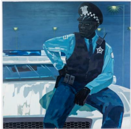
Kerry James Marshall. Untitled (policeman) . 2015. Synthetic polymer paint on PVC panel with plexi frame, 60 x 60" (152.4 x 152.4 cm). © 2016 Kerry James Marshall.