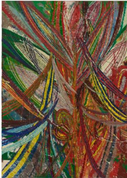
Mark Grotjahn. Untitled (Circus No. 3 Face 44.20). 2013. Oil on cardboard mounted on linen, 8' 5 1/2" x 72 1/2" (257.8 x 184.2 cm). © 2016 Mark Grotjahn.