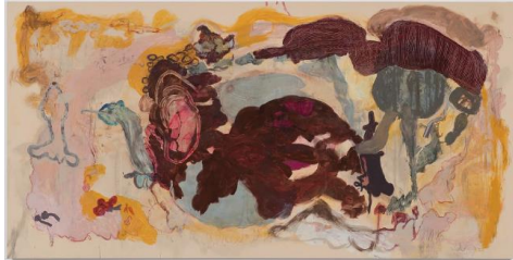
Michaela Eichwald. Duns Scotus . 2015. Synthetic polymer paint, oil, wax, and lacquer on artificial leather, 53 1/2 x 106 1/4" (136 x 270 cm).