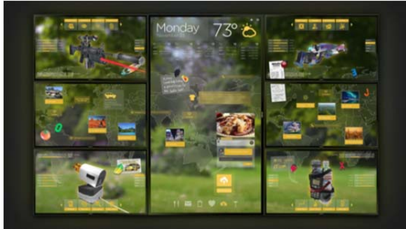
Tabor Robak. Xenix . 2013. Seven-channel video (color, silent; 5 min.), real-time 3D. 53 1/2 x 89" (135.9 x 226.1 cm). The Junior Associates of the Museum of Modern Art