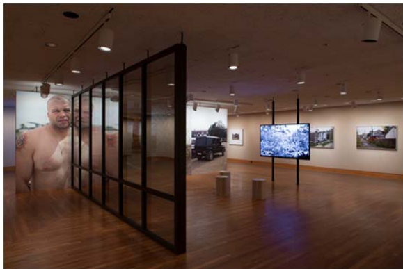
David Hartt. Interval. 2014. Two-channel video (color, sound; 15:07 min.) and three archival pigment prints mounted to Dibond. Archival pigment prints each 36 x 54" (91.44 x 137.16 cm). Fund for the Twenty First Century