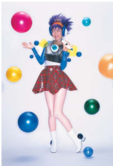
Mariko Mori. Birth of a Star. 1995. 3D Duratrans print and acrylic, MP3 player, speakers, and audio. 72 x 48 x 1/4" (182.9 x 121.9 x .64 cm). Gift of Gwen and Peter Norton

Basim Magdy. My Father Looks for an Honest City. 2010. Super 8 film transferred to video (color, sound). 5:28 min. Fund for the Twenty First Century