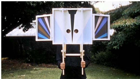
Basim Magdy. A 240 Second Analysis of Failure and Hopefulness (With Coke, Vinegar and Other Tear Gas Remedies). 2012. Color slides and two synchronized Kodak slide carousel projectors. Fund for the Twenty First Century

Basim Magdy. Time Laughs Back at You Like a Sunken Ship. 2012. Super 8 film transferred to video (color, sound). 9:31 min. Fund for the Twenty First Century