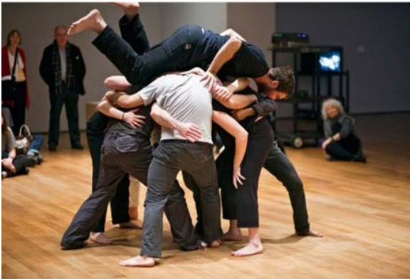
Simone Forti. Dance Constructions. 1960-61. Rights to perform, and reconstruct props for, the following works: Rollers, See Saw, Huddle, Slantboard, Hangars, Platforms, Accompaniment for La Monte's "2 Sounds," and La Monte Young's 2 Sounds, Censors, From Instructions. Seven related drawings, pen and pencil on paper; five related photographs; 11 videos documenting the performances, artist's notebook. Committee on Media and Performance Art Funds