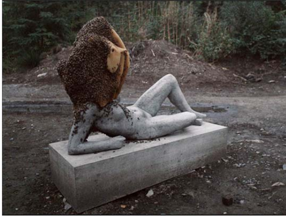
Pierre Huyghe. A Way in Untilled. 2012-13. Video (color, sound). 13:59 min. The Michel H. Dunn Memorial Fund