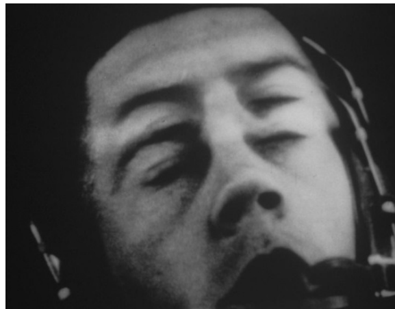
Wolf Vostell. Wolf Vostell Dé-coll/age Video-Films 1963-71 . 1972. Seven 16mm films transferred to video (black and white, sound). Duration variable. Committee on Media and Performance Art Funds