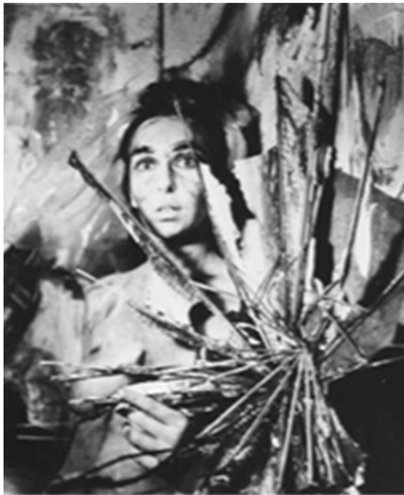
Carolee Schneemann. Eye Body Portfolio . 1963/2005. Eighteen gelatin silver prints. 24 x 20" (61 x 51 cm) each. Gift of the Artist