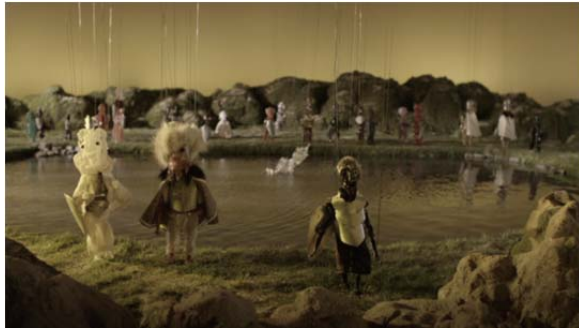
Wael Shawky. Cabaret Crusades: The Secrets of Karbala . 2014. Video (color, sound). 120 min. Purchase