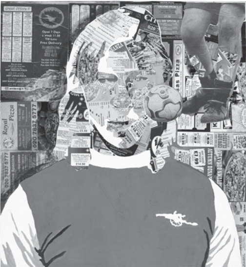
IMAGE SIXTEEN: Sarah Lucas. British, born 1962. Geezer . 2002. Oil, cut-and-pasted printed paper, and pencil on wood, 31 \frac{7}{8} x 29 \frac{1}{2} " (81 x 74.9 cm). Purchased with funds provided by The Buddy Taub Foundation, Dennis A. Roach, Director, 2003. © 2008 Sarah Lucas