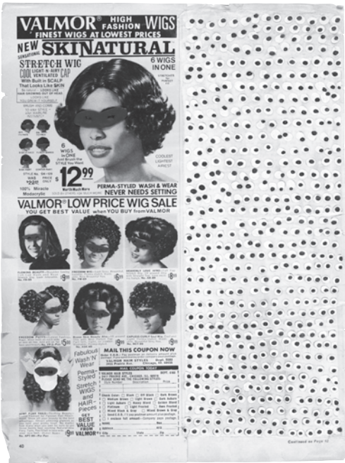
IMAGE SEVENTEEN: Ellen Gallagher. American, born 1965. Skinatural . 1997. Oil, pencil, and plasticine on magazine page, 13 \frac{3}{4} x 10" (33.7 x 25.4 cm). Gift of Mr. and Mrs. James R. Hedges IV, 2000. © 2008 Ellen Gallagher