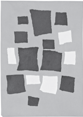
IMAGE NINE: Jean (Hans) Arp. French, born Germany (Alsace). 1886–1966. Collage with Squares Arranged According to the Laws of Chance . 1916–17. Torn-and-pasted paper on blue-gray paper, 19 1/8 x 13 3/8" (48.5 x 34.6 cm). Purchase, 1937. © 2008 Artists Rights Society (ARS), New York/VG Bild-Kunst, Bonn