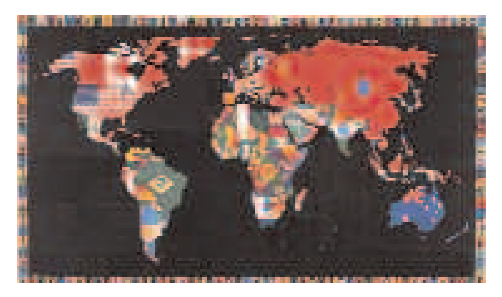
IMAGE THREE : Alighiero e Boetti (Italian, 1940–1994). Map of the World . 1989. Embroidery on fabric, 46 ¼" x 7' 3 ¼" x 2" (117.5 x 227.7 x 5.1 cm). Scott Burton Fund. © 2009 Estate of Alighiero e Boetti