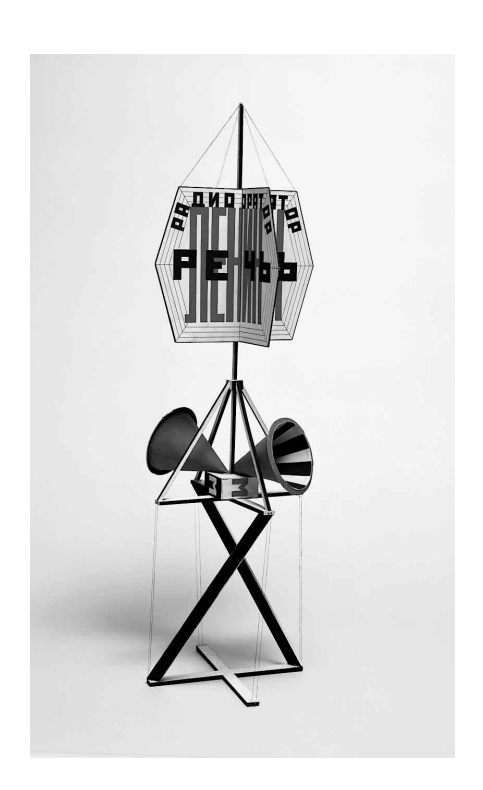
IMAGE TEN: Gustav Klucis. Latvian, 1895–1944. Maquette for Radio-Announcer . 1922. Construction of painted cardboard, paper, wood, thread, and metal brads, 45 ¾ x 14 ½ x 14 ½" (106.1 x 36.8 x 36.8 cm). The Museum of Modern Art, New York. Sidney and Harriet Janis Collection Fund

IMAGE NINE: Gerrit Rietveld. Dutch, 1888–1964. Child's Wheelbarrow. 1923. Painted wood, 12 ½ x 11 ¾ x 33 ½" (31.8 x 28.9 x 85.1 cm). Manufacturer: Gerard van de Groenekan. The Museum of Modern Art, New York. Gift of Jo Carole and Ronald S. Lauder. © 2006 Artists Rights Society (ARS), New York / Beeldrecht, Amsterdam